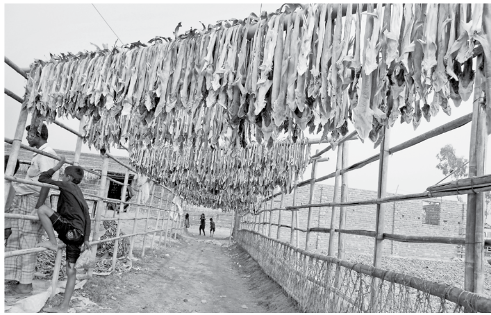
Spadenose shark being dried in one of the fish drying centres in Cox's Bazar.

How do we know that the laws don't reach the fishers? We interviewed more than a thousand coastal fishers engaged in sharks and ray fisheries in almost all coastal fishing communities. In 2016, most of the fishers spoke to had limited knowledge about the protected status of sharks and rays. Although in subsequent years, a small number of fishers showed some knowledge of some laws, they did not know which species were protected.