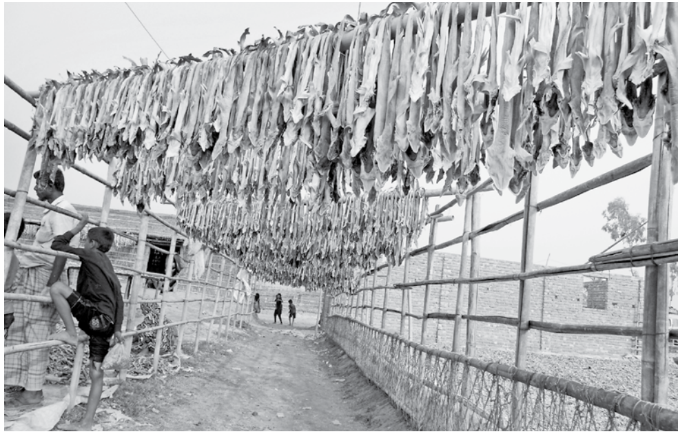
Spadenose shark being dried in one of the fish drying centres in Cox's Bazar.

How do we know that the laws don't reach the fishers? We interviewed more than a thousand coastal fishers engaged in sharks and ray fisheries in almost all coastal fishing communities. In 2016, most of the fishers spoke to had limited knowledge about the protected status of sharks and rays. Although in subsequent years, a small number of fishers showed some knowledge of some laws, they did not know which species were protected.