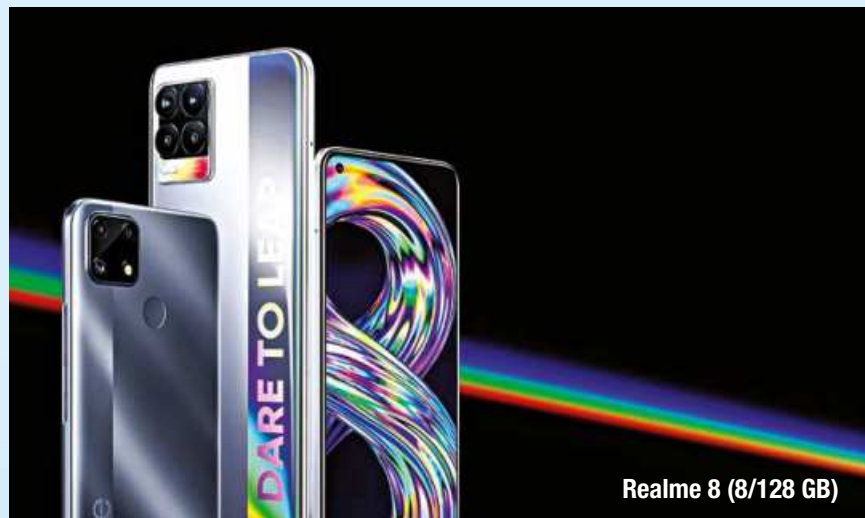
Realme 8 (8/128 GB)

All of the phones discussed on our list have plastic back panels which are normal for the price range. Also, all of them are Widevine L1 certified which means you can stream Netflix and other streaming services in HD. For this budget range, the manufacturers had to cut corners here and there but they all excel in their selected aspects.