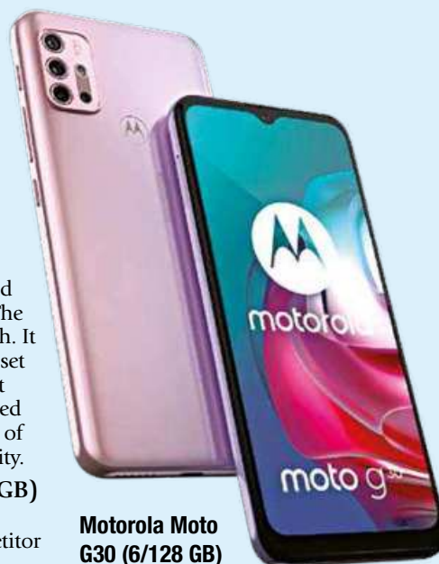
Motorola Moto G30 (6/128 GB)

Xiaomi's Note 10 is a worthy competitor in the mid-range budget. It packs a punchy super AMOLED display with the highest peak brightness on our list. Coupled with a dual-stereo setup, this phone is a sensational media consuming device. The 5,000 mAh battery helps it stay alive for a long period. The Snapdragon 678 octa-core processor delivers a good but not great gaming experience. The cameras on this phone are solid but tend to overly saturated images at times. As a whole,