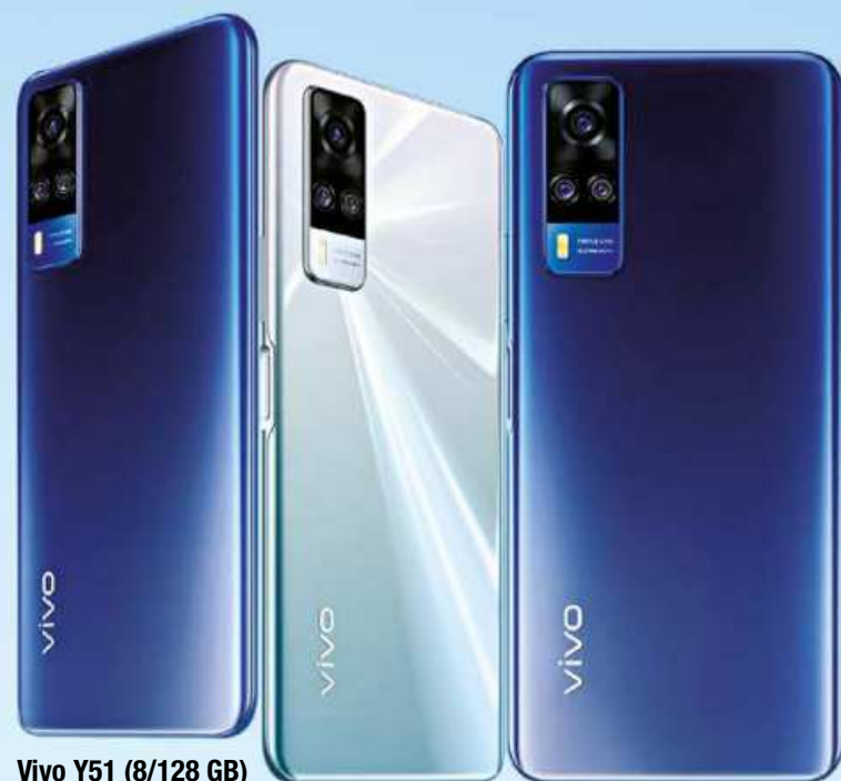
Vivo Y51 (8/128 GB)