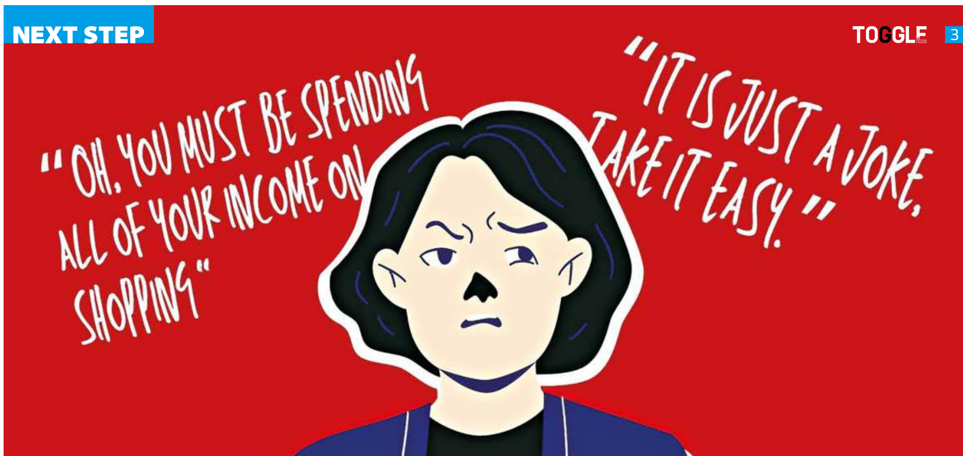
ILLUSTRATION: ZARIF FAIAZ