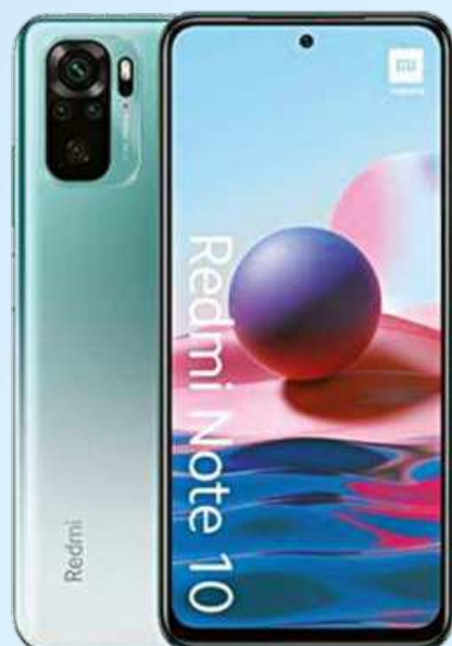
Xiaomi Redmi Note 10 (6/128 GB)