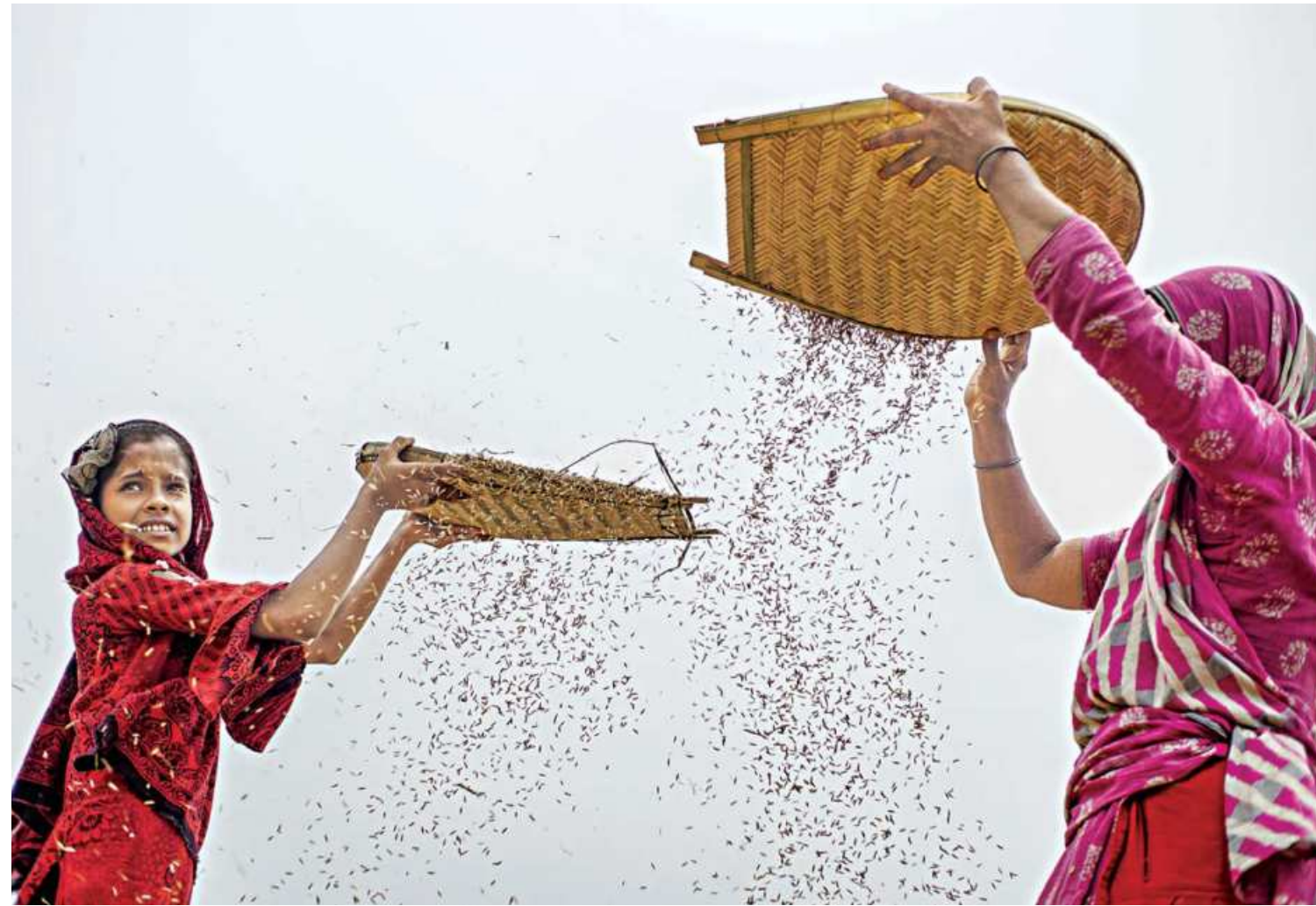
A woman and her little daughter winnowing paddy in the capital's Beribandh area. Boro paddy is taken to Beribandh area after it is harvested from different villages in Savar. A female worker earns about Tk 600 a day for winnowing the paddy.