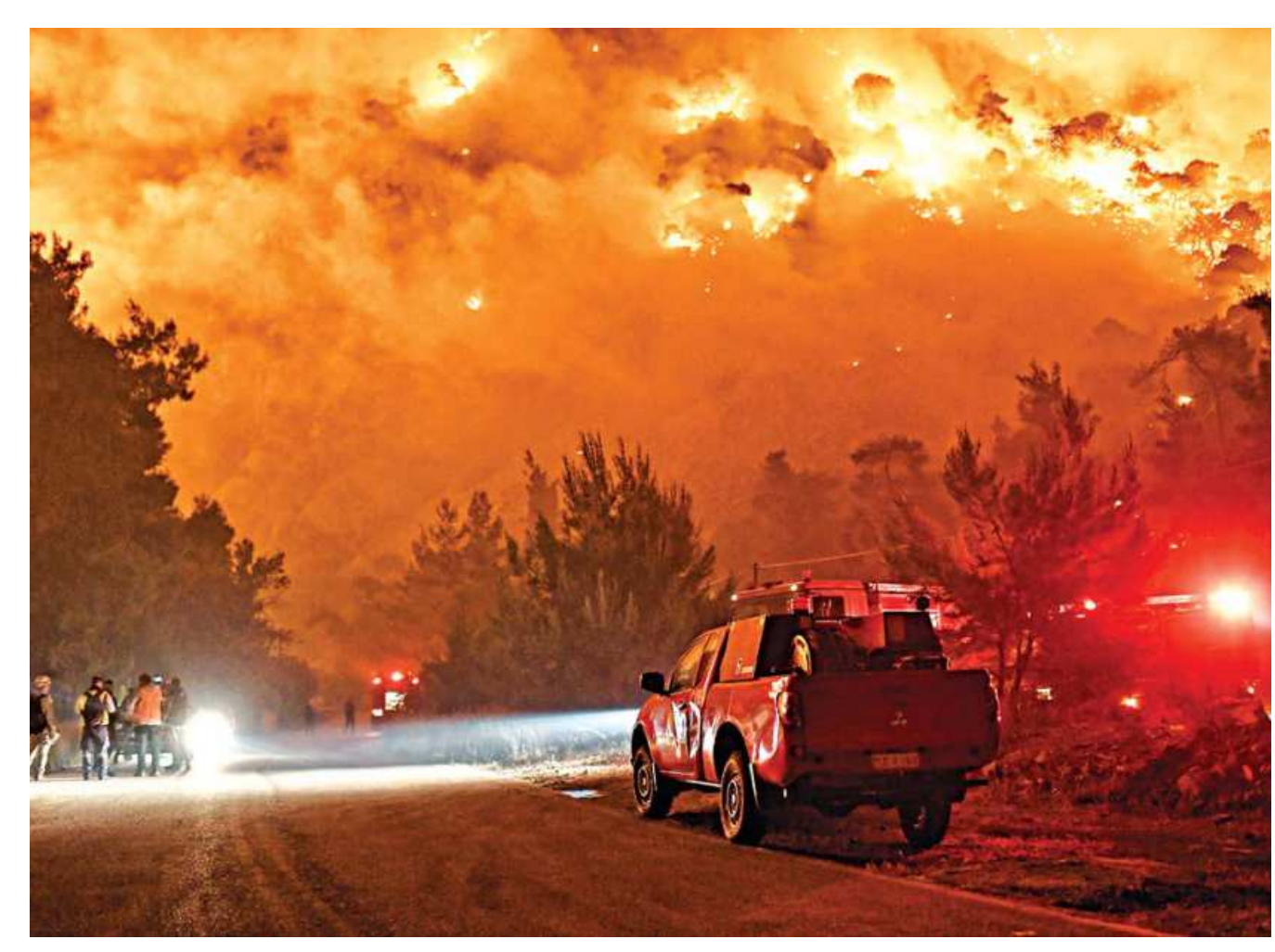
Flames rise as firefighters and volunteers try to extinguish a fire burning in the village of Schinos, near Corinth, Greece, May 19, 2021. Picture taken May 19, 2021. Several Greek villages were evacuated Thursday as firefighters battled the country's first major blaze of the year on a mountain range overlooking the Gulf of Corinth. No injuries were reported.