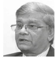
M A MANNAN , MP, Minister, Ministry of Planning

If we want an inclusive budget, we must pinpoint where the need lies and allocate the budget accordingly. The critical discourse among civil society organisations, non-governmental organisations (NGOs), and persons with disabilities on these issues should be reflected in the budget. Strict monitoring after the budget has been allocated is crucial because the people that are meant to be reached through the budget allocations often gain no benefit from them in the end.