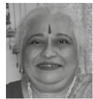
AROMA DUTTA , Member of the Parliament & Member, Standing Committee on Ministry of Social Welfare

The government allocates a budget based on the number of persons with disabilities living in the country. However, we must also consider their families. If we can support the primary caregivers of the persons with disabilities, the caregivers can contribute to the economy.