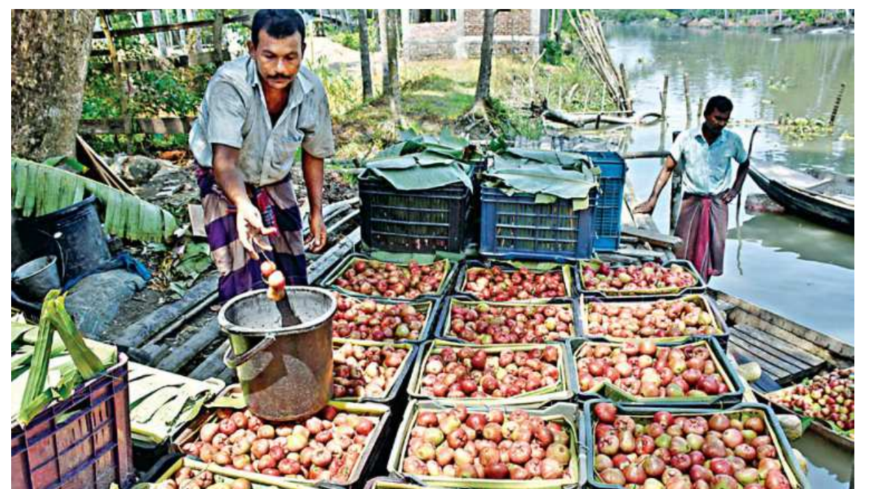
Java apple collected from farmers of Purba Brahmanakathi village in Atghar Kuriana at Tk 10 per kilogramme being packed for transportation by traders of Pirojpur district's Nesarabad upazila seeking higher profits through sales in the capital and around the country. Every day around 100 maunds (one maund equals about 37 kilogrammes) of the fruit is being sent off. The photo was taken recently.