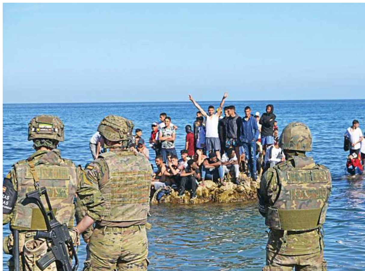
Spanish soldiers stand guard as migrants stand on rocks off the shore of the Spanish enclave of Ceuta, on Tuesday. A European commissioner yesterday vowed that the continent would not be "intimidated" after some 8,000 migrants rushed into Ceuta from Morocco since Monday.

At least 10 people had been killed in Chin State in the past week, according to figures from the Assistance Association for Political Prisoners activist group. It puts the countrywide death toll since the coup at 805.