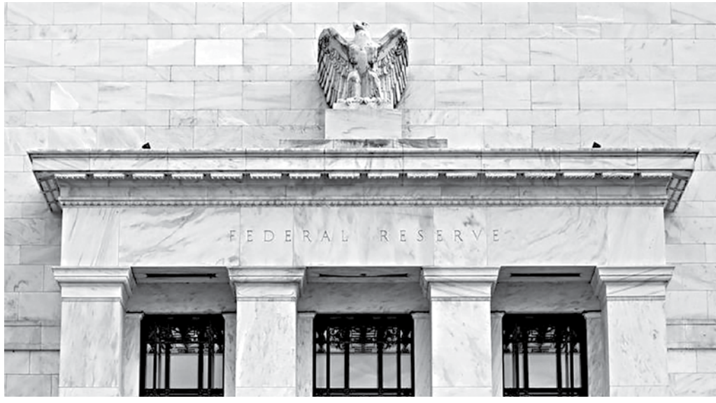
The Federal Reserve building is pictured in Washington, DC.

By December 2019, production had already fallen 2 per cent below its previous trend, as