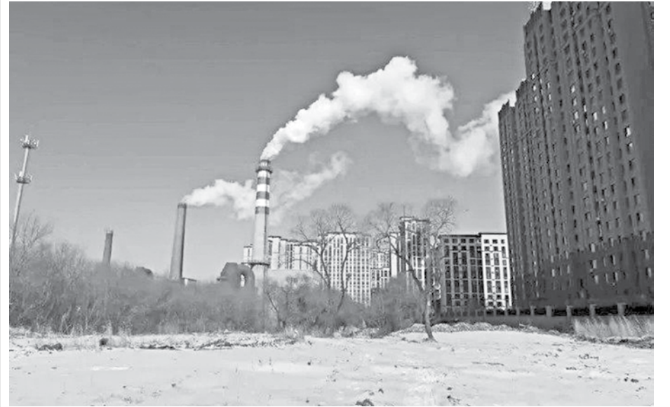
A coal-fired heating complex is seen behind the ground covered by snow in Harbin.

In the Philippines, where coal is set to be the dominant power source for years even after a ban on new coal plant proposals, Energy Secretary Alfonso Cusi said the energy transition should be "fuel and technology-neutral".