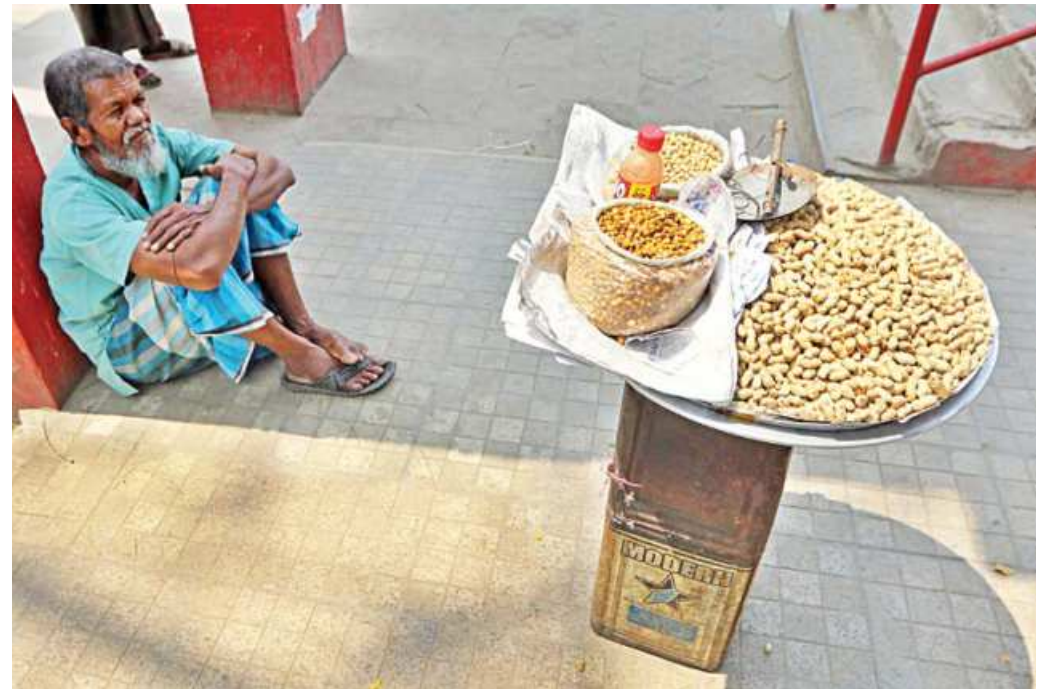
Incomes of people like this peanut vendor have dropped significantly amid the coronavirus pandemic.

The livelihood of the workers in the informal sector would not have worsened after the second wave if the schemes had been implemented