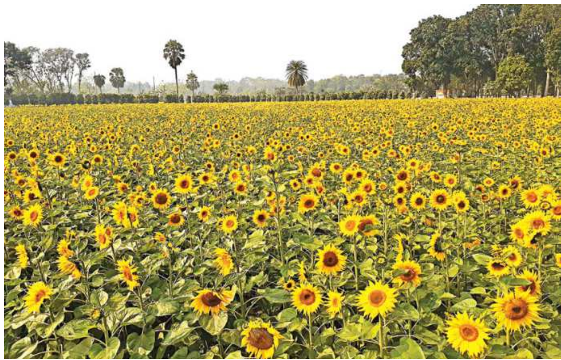
This year sunflower has been cultivated on 15,403 hectares of land across the country, which is three times higher than the target.

In terms of seeds, 11,628 metric tonnes were initially targeted to be