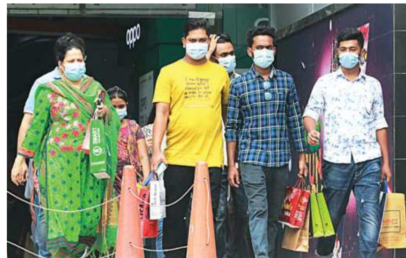
Shoppers coming out of a shopping mall in the capital. The photo was taken before Eid-ul-Fitr.

When customer turnout started to slowly increase in the 15-day lead-up, Kabir had attributed the increased sales to brand value and a loyal customer base.