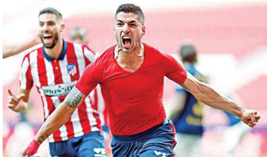
Atletico Madrid's Luis Suarez is ecstatic after scoring his side's second goal during Sunday's 2-1 win against Osasuna. The Uruguayan striker's 88th-minute strike kept his side on course for the La Liga title.

Simeone had talked up the Uruguayan's big-game experience ahead of the match,