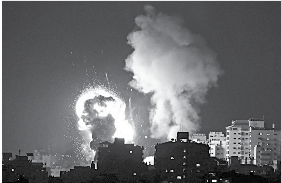
Israeli forces continued to bombard Palestinian territory well into Tuesday morning.

This time though, the voices of opposition to Israeli actions and US policies on the long running Palestinian-Israeli conflict has reached relatively higher sound decibels. There are more sympathetic voices inside the US Congress and among the common people as well. This has caused deep concerns within the