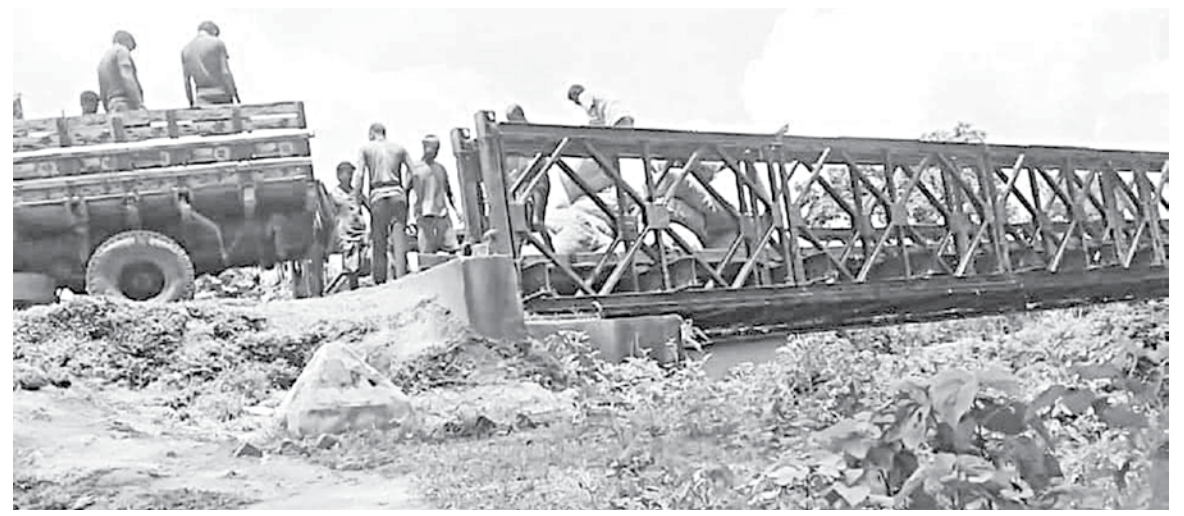
The export and import business activities in Batuli Customs Station and Immigration Check Post area of Moulvibazar's Juri upazila are being hampered badly as the worn-out Bailey bridge lies unrepaired for long there

At one stage, freight cars from both countries were parked around the middle of the bridge. The goods were then loaded and unloaded from one vehicle to another. But later, due to heavy rains, the soil on both sides of the Bailey bridge was removed from the hill slopes, putting the bridge under threat. Since then, the export and