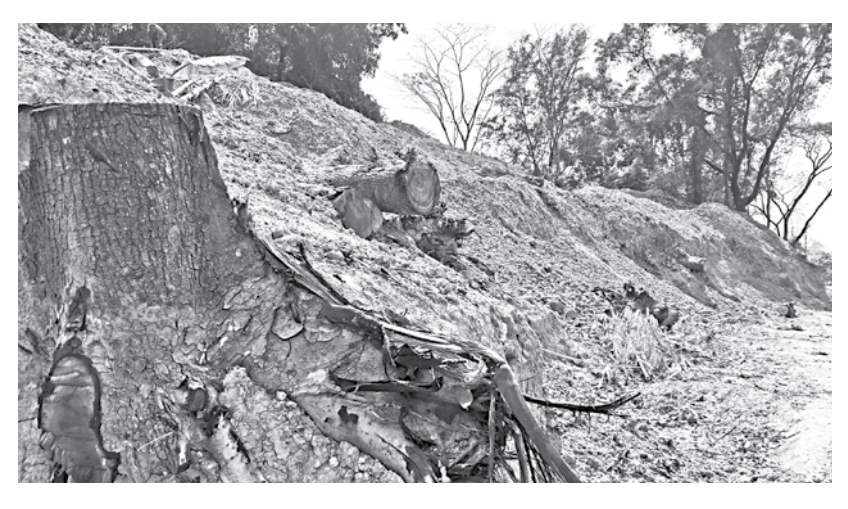
Stumps of trees razed by the city corporation. This photo was taken recently from Kazitula Uchasarak area.