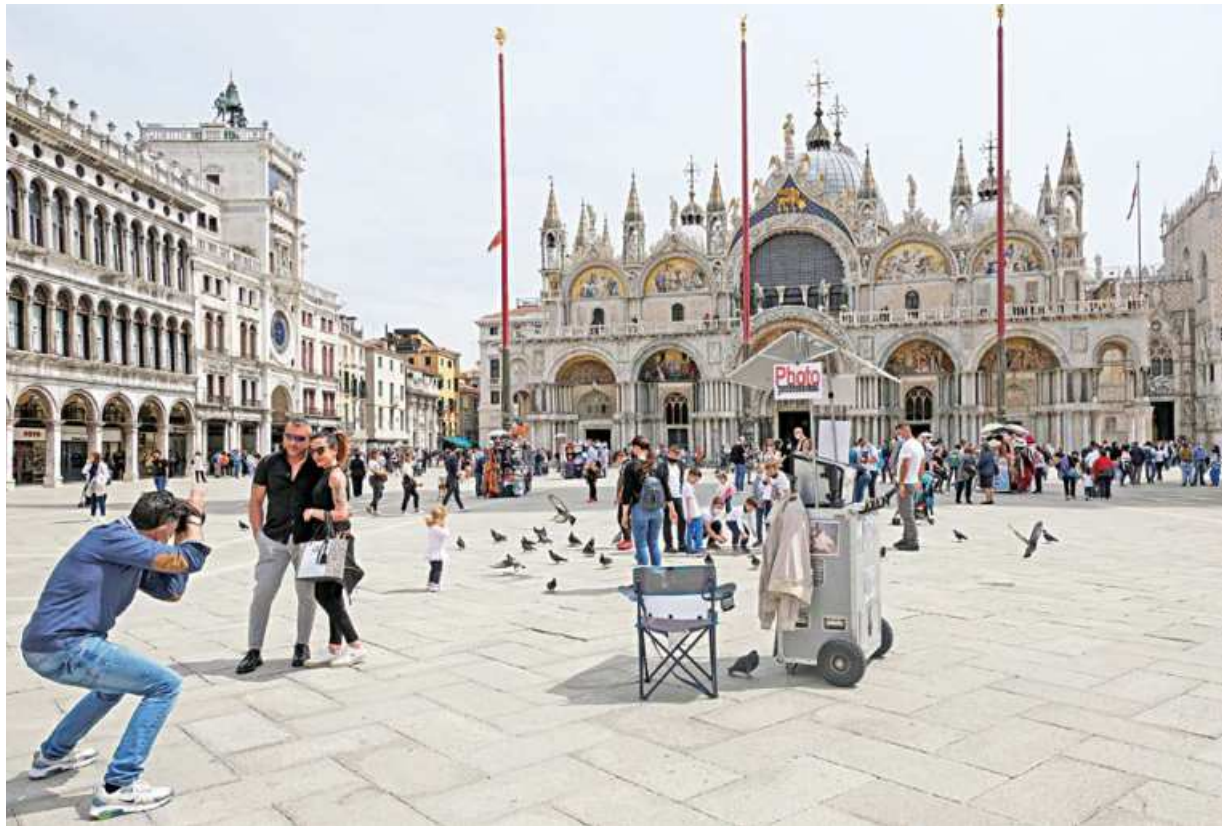
Tourists come back to St Mark's Square as Italy lifts quarantine restrictions for travellers arriving from European Union countries, Britain and Israel and begins offering Covid-free flights in a bid to revive the tourism industry amid the coronavirus disease pandemic, in Venice, Italy yesterday.