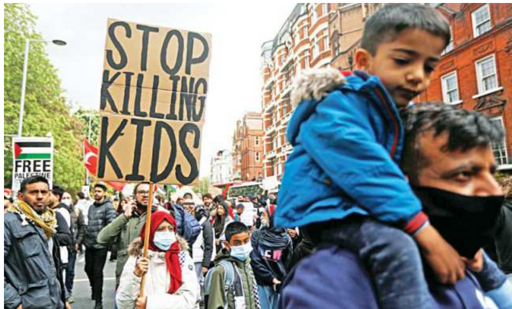
Pro-Palestinian demonstrators attend a protest following a flare-up of Israeli-Palestinian violence, in London, Britain, on Saturday. Protesters marched around the world in support of Palestinians amid the worst Israeli-Palestinian violence since the 2014 Gaza war.

But he warned "this is the most dangerous scenario" as it could cause the uprising to spread to the West Bank and "this will end the Palestinian Authority," deepening the uncertainty and helplessness of a new generation of Palestinians.