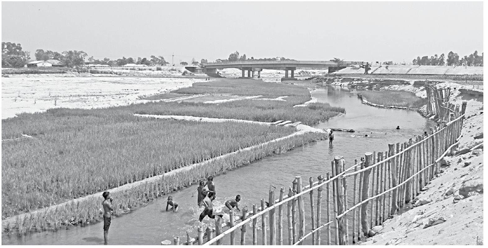
Children frolic in ankle- to knee-deep water of Charalkantha river near Kachukata bridge on Nilphamari-Jaldhaka road in Nilphamari. The second biggest river in the district lost its depth and turned into a narrow channel after more than half of it was filled up by earth that had been piled up on its bank after its excavation work last year.