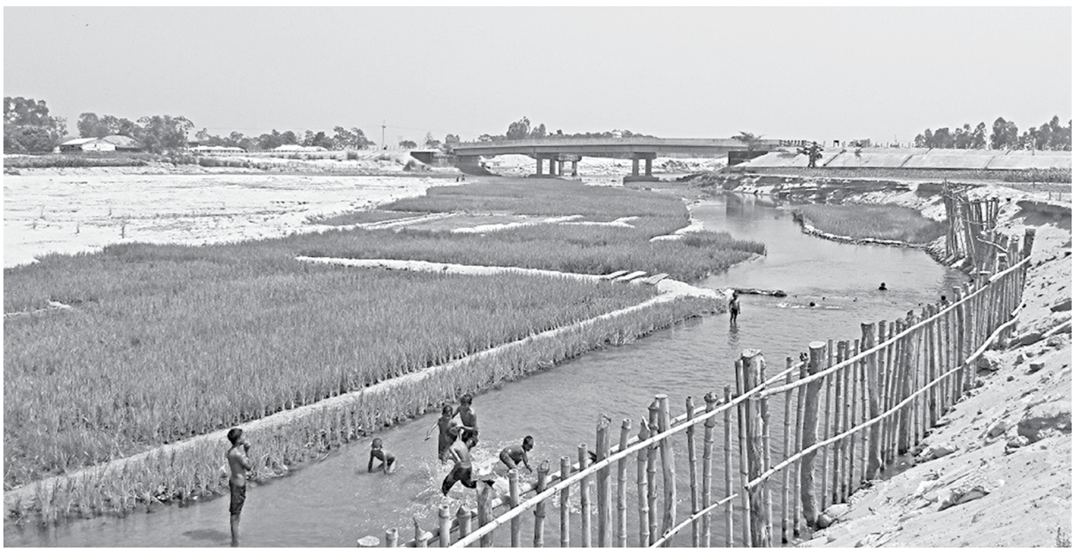
Children frolic in ankle- to knee-deep water of Charalkantha river near Kachukata bridge on Nilphamari-Jaldhaka road in Nilphamari. The second biggest river in the district lost its depth and turned into a narrow channel after more than half of it was filled up by earth that had been piled up on its bank after its excavation work last year.