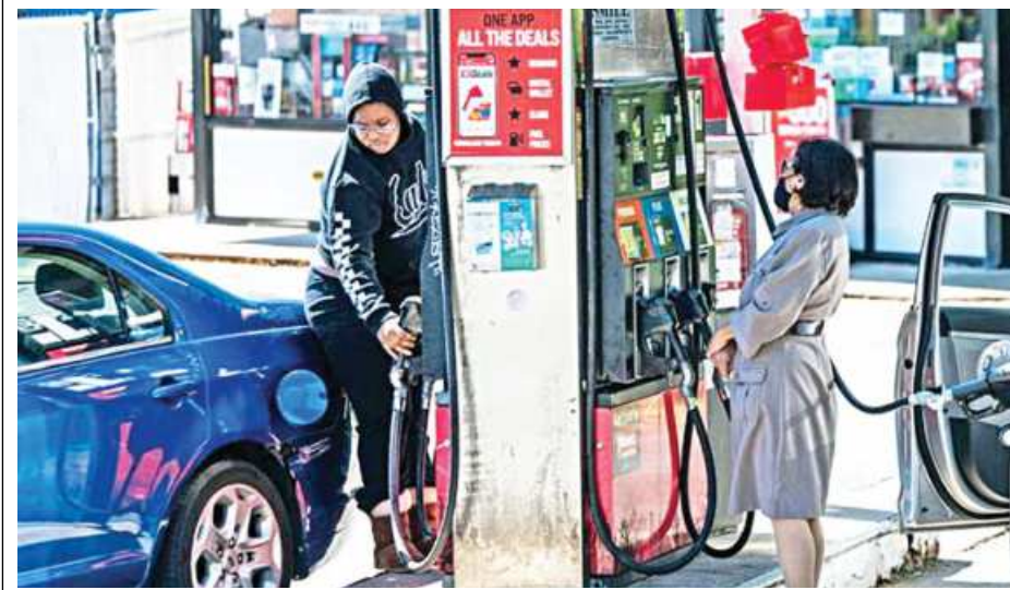
Motorists fill their cars at one of the few remaining gas stations that still has fuel in Arlington, Virginia on May 13, 2021.