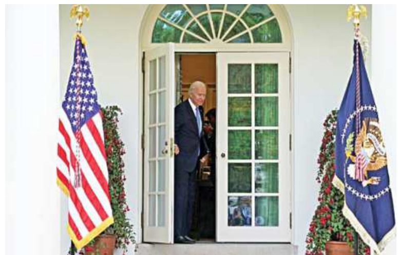
US President Joe Biden leaves after speaking about the coronavirus disease response and the vaccination programme from the Rose Garden of the White House in Washington, US.

"The trend lines continue to be positive," a senior White House official told Reuters on Wednesday. The White House also believes the Fed can handle what comes up, he said.