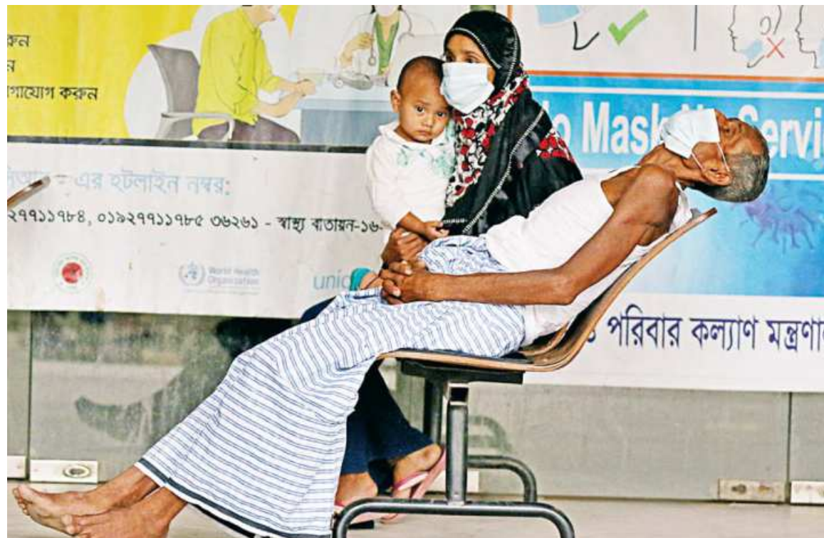
Hospitals have struggled with the number of patients and are burdened with shortages of ventilators, ICUs and rooms. These need emergency attention.

There is a lot to learn from the implementation experience in health and social protection. We did not have the benefit last year of knowing what we know now about how the policy response to the pandemic works and where the fault lines are.