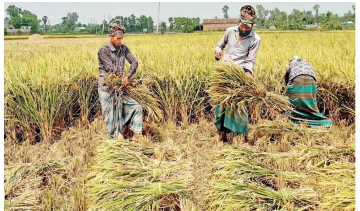
Farmers harvest Boro paddy from a field in Tangail's Kalihati upazila recently.

"Though, some farmers reported damage caused by a short heatwave in the first week of April," the report said, adding that the agriculture ministry was in the process of estimating the