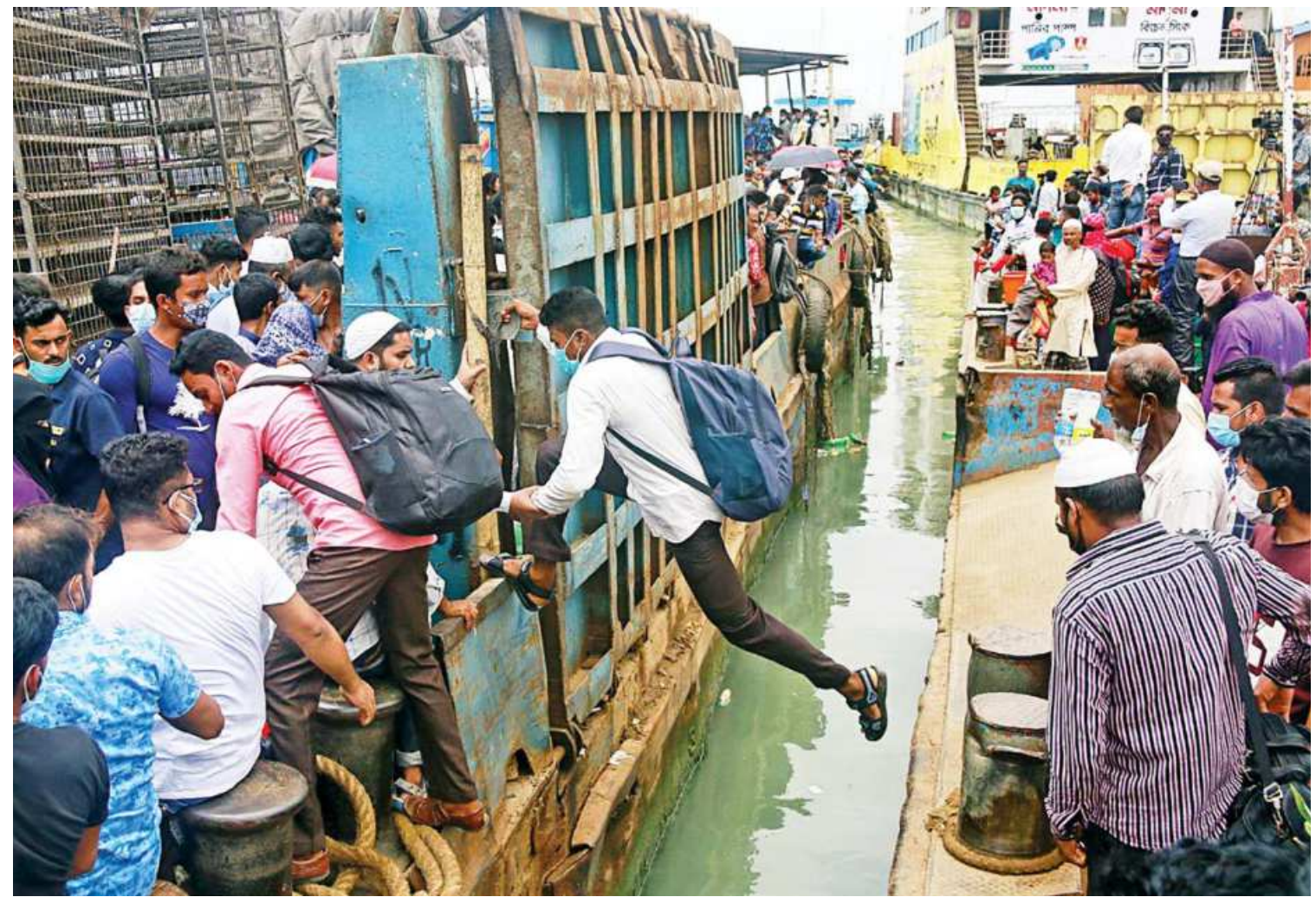
Risking his life, a man leaps on to a ferry that left the pontoon yesterday. He managed to escape an accident by inches. Like him, many others crossing the mighty Padma are taking risks to attend Eid with their families. The photo was taken at Shimulia Ferry Ghat around 1:00pm yesterday. Story on page 1