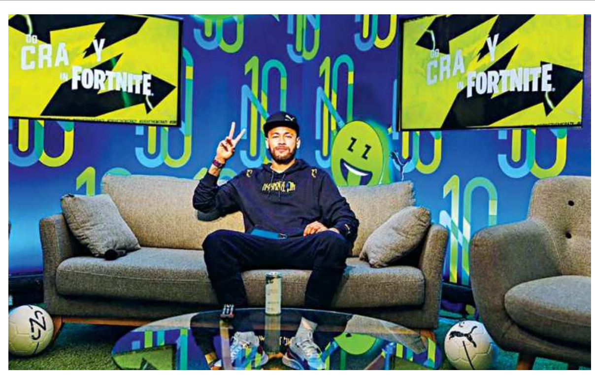
Neymar had a blast on the famous Fortnite video game alongside gaming stars on Monday evening. After disappointment in the Champions League and Ligue 1 title race, Neymar had a good time by indulging in one of his favourite pastimes: video games.

Rome on Monday. "It's 10,000 people in a Village, playing a tournament," he added, referring to the Olympic Village where athletes will stay.