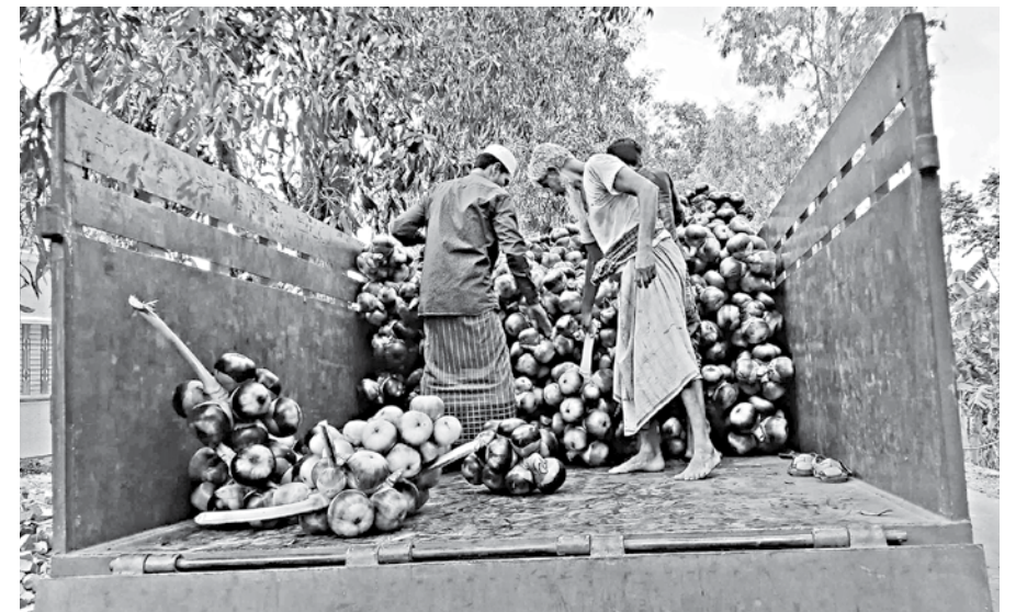
Workers load up a truck with palmyra palm fruits in Charakhali village of Pirojpur's Indurkani upazila.

Khejurtala village resident Selim Faraji said he has been making as much as Tk 600 daily, by climbing palmyra palm trees to collect the fruit.