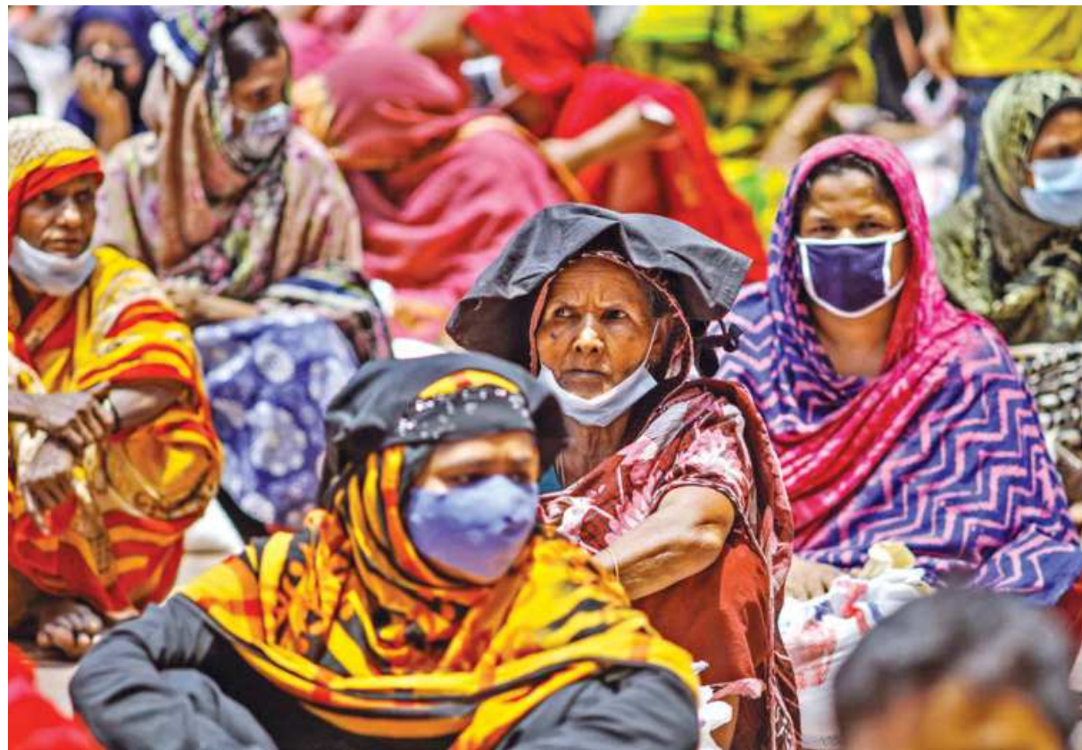
Underprivileged women, whose income shrank during the pandemic, waiting for eid gifts at a programme funded by State Minister Kamal Ahmed Mojumder in Mirpur in the capital yesterday afternoon.

RAMADAN MAY SEHRI IFTAR 26 9 6:35 27 10 3:50 6:35 28 11 3:49 6:36