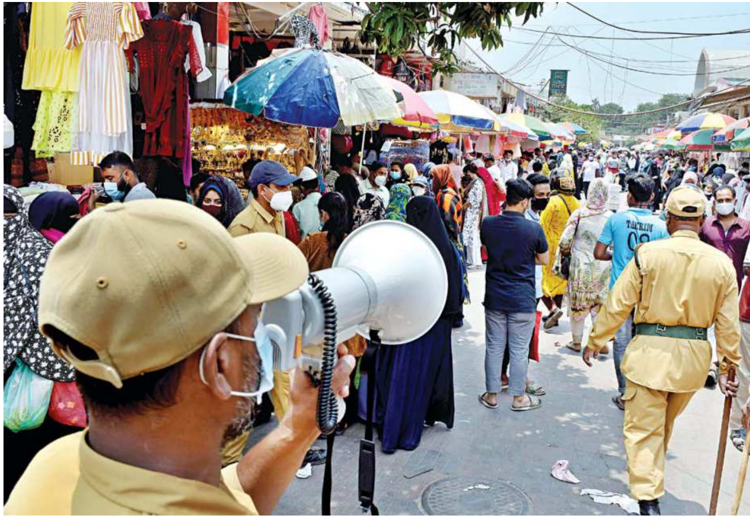
A security worker announcing health guidelines with a handheld microphone and urging customers to maintain physical distancing and wear masks while shopping at the New Market in the capital. The photo was taken yesterday.