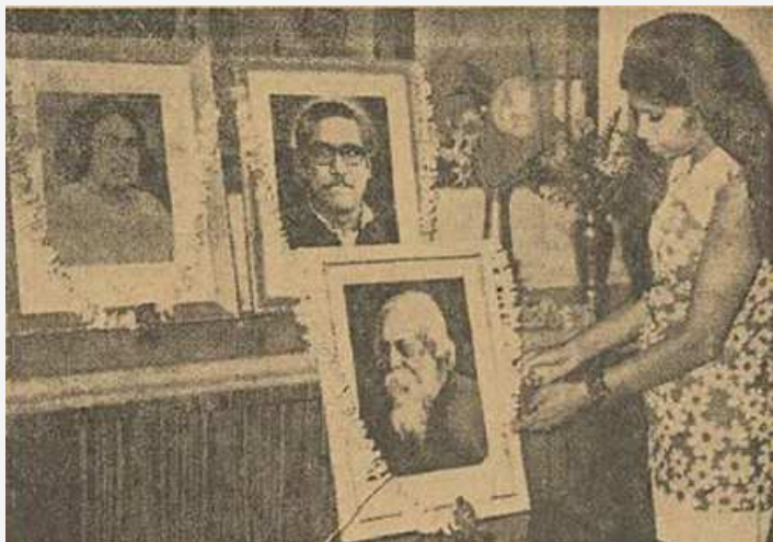
A portrait of Rabindranath Tagore was garlanded inside the Bangladesh Mission in Kolkata on May 9, 1971. Pictures of Kazi Nazrul Islam and Bangabandhu Sheikh Mujibur Rahman were also seen flanking Rabindranath's portrait.