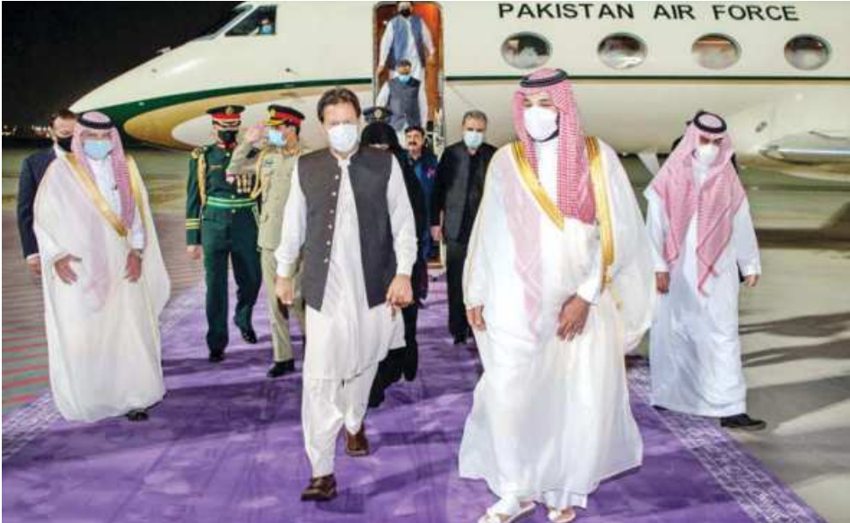
A handout picture provided by the Saudi Royal Palace yesterday, shows Saudi Crown Prince Mohammed bin Salman (R), receiving Pakistan's Prime Minister Imran Khan, in Saudi Arabia's Red Sea city of Jeddah.

Wang said that Beijing believes "dividing the world into ideological camps goes against multilateralism," and called on UN members to "seek equality and justice, not hegemony."