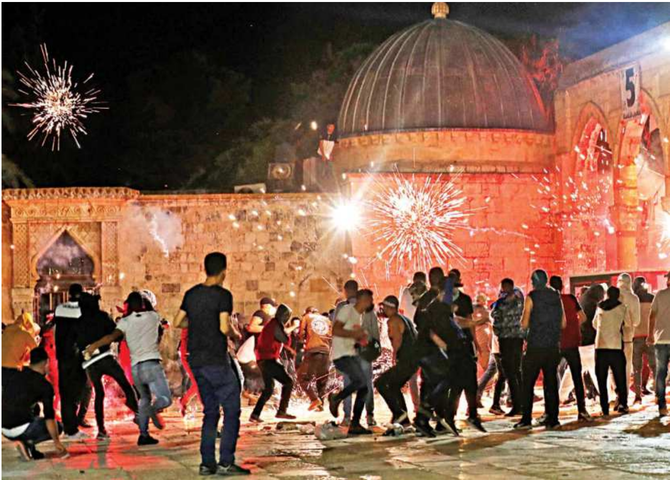
Stun grenades burst in the air amid clashes between Palestinian protesters and Israeli security forces at the al-Aqsa mosque compound in Jerusalem, on Friday night.