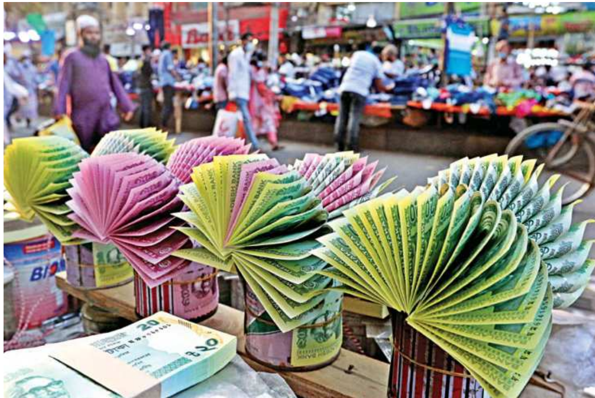
New bank notes on display for sale in the capital's Gulistan area yesterday. Ahead of Eid every year, such fresh notes remain in high demand as these are gifted to children by the elders as Eidi.

the survey found the highest percentage -- 20.22 percent -- in flooded floors of under-construction buildings, 19.10 percent in plastic drums, 11.24 percent in buckets, 7.87 percent in water tanks, 6.74 percent in the holes of water meters, 2.25 percent in flower pots and trays, 4.49 percent in plastic bottles and 3.37 percent at the bottom of elevator shafts. The survey also found that the highest number of containers with the larvae -- 43.82 percent -- were found in high rise buildings, 34.83 percent at under-construction buildings, 15.73 at single houses and 5.62 percent in slum areas. Manzur Chowdhury, entomologist and former president of Zoological Society of Bangladesh, said April and the first week of May has seen rainfall on five or six SEE PAGE 4 COL 1