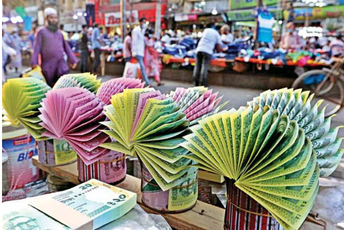
New bank notes on display for sale in the capital's Gulistan area yesterday. Ahead of Eid every year, such fresh notes remain in high demand as these are gifted to children by the elders as Eidi.