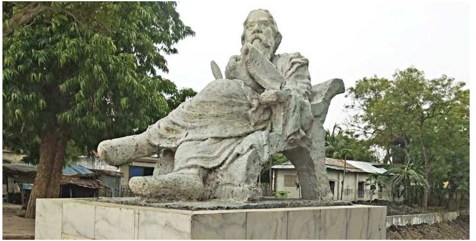
A statue of Rabindranath Tagore in Patisar, outside the museum