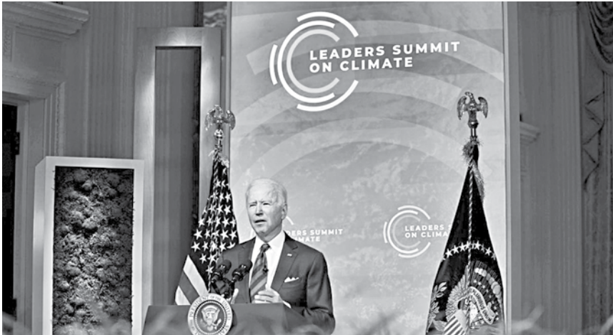
President Joe Biden speaks to the virtual Leaders Summit on Climate from the White House in Washington, US on April 22, 2021.

every sector of the US economy. And that will require, among other things, producing electricity from renewable sources, cars and trucks running on electricity, phasing out chemicals used in refrigeration and air-conditioning that are thousands of times more potent than carbon dioxide at warming the planet, and using greenhouse gas removing technologies to suck carbon dioxide out of the air.