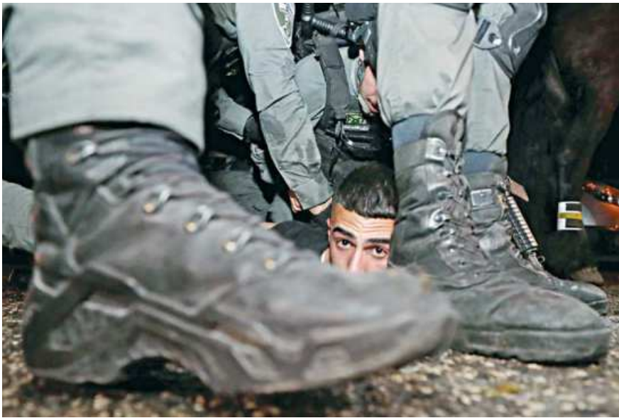
Israeli police detain a Palestinian protester amid ongoing tension ahead of an upcoming court hearing in an Israel-Palestinian land-ownership dispute in the Sheikh Jarrah neighbourhood of East Jerusalem. Twenty-two Palestinians were wounded in overnight clashes with Israeli police in annexed east Jerusalem, the Red Crescent said yesterday.

India is the largest tourist market for Sri Lanka and the Maldives. Sri Lanka has reported 117,529 infections with 734 deaths since the start of the pandemic. The Maldives has reported 32,665 cases with 74 deaths.