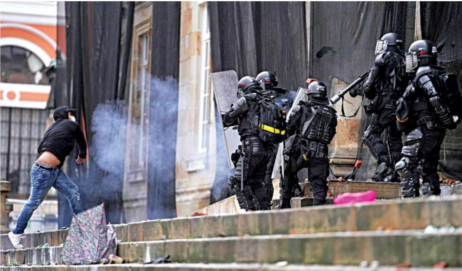
A demonstrator prepares to throw an object towards the police during a protest in Bogota, Colombia, wednesday. Riot police fired tear gas at protesters in Bogota on Wednesday during an eighth day of nationwide anti-government demonstrations, after crowds attacked police stations in the capital overnight. The protests were originally called in opposition to a now-canceled tax reform plan, but demonstrators have broadened their demands to include government action to tackle poverty, police violence and inequalities in the health and education systems. At least 24 people have died in the protests.

The United States was supposed to have pulled all forces out by May 1 under a deal struck with the Taliban last year, but Washington pushed back the date to September 11 -- a move that angered the insurgents.