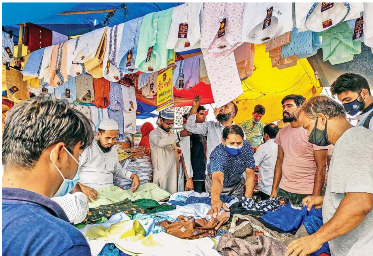
Most of the people at this street shop in the capital's Baitul Mukarram Mosque area are seen without face masks. Although a mobile court has fined various shopping malls for not complying with hygiene rules and social distancing, many people, mostly customers, are still not maintaining any of those. The photo was taken yesterday.