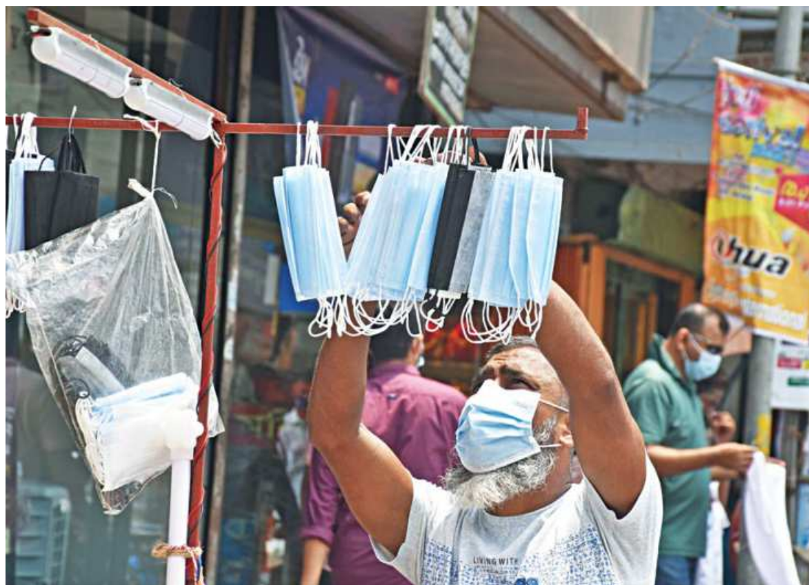
Masks have become a hygienic necessity due to the pandemic. But this small traders is selling them by hanging them out on the dusty roads, which renders the hygiene aspect useless. This photo was taken yesterday from Barishal city's Girza Moholla area.