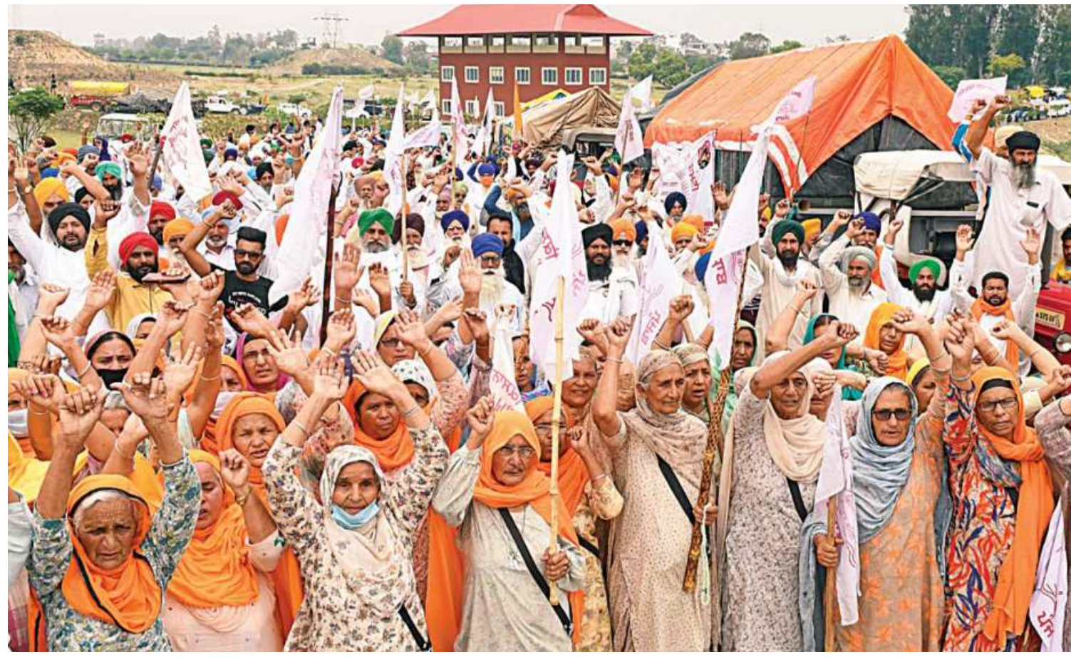
Farmers shout slogans as they make their way to Delhi to join farmers who are continuing the protest against the central government's recent agricultural reforms, in Beas some 55 km from Amritsar, India yesterday. While India battles soaring Covid-19 infections, on the outskirts of New Delhi thousands of farmers still occupy camps where they are keeping up a months-long sit-in protest against government legislation that they say harms them. Farmers began marching towards New Delhi in November to protest against three laws that give the private sector a greater role in buying, pricing and storing agricultural goods and reduce state protection enjoyed by growers for decades.

Fighting was also reported in other provinces.