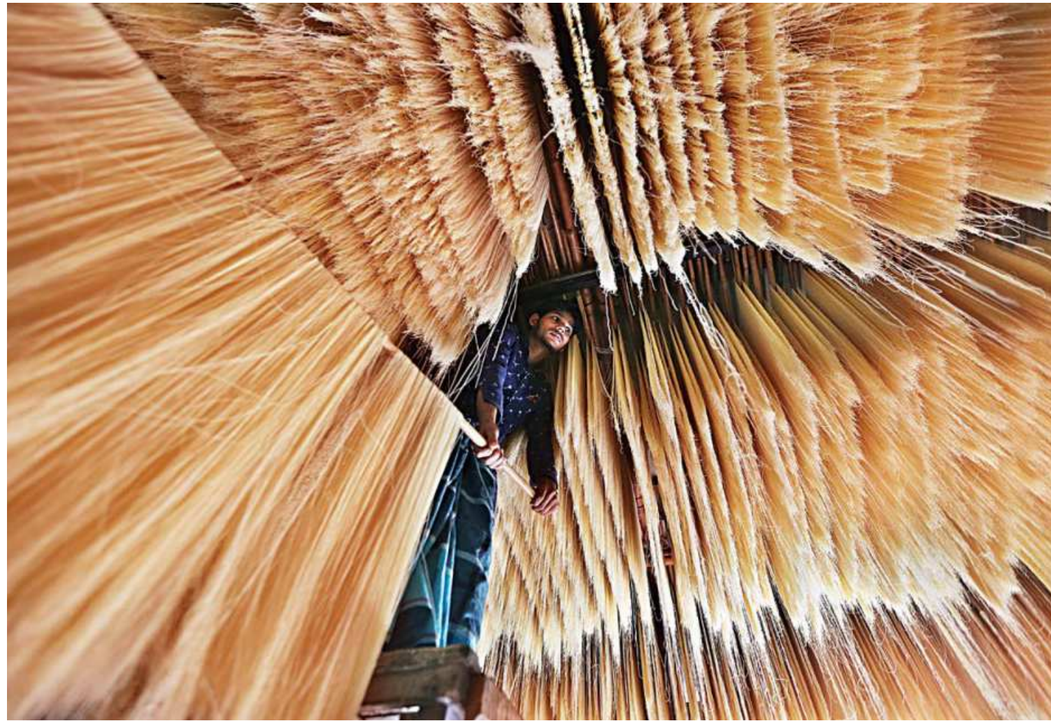
With Eid-ul-Fitr coming up, many factories in and around the city have gone into overdrive to produce the amount of "shemai (vermicelli)" needed during the festival. In almost every household across the country, vermicelli is made as a special dessert. For years, this dish has been a staple for big occasions. The photo was taken in Char Khalpar area of the capital's Kamrangirchar.