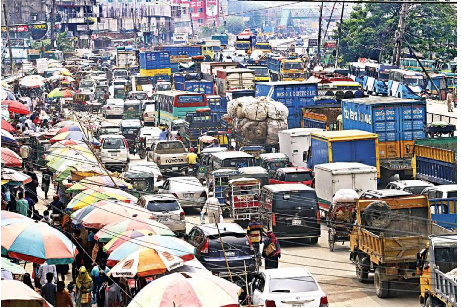
There is barely any room left due to congestion on Dhaka-Chattogram highway in Sanarpur area amid what officials say is a "lockdown" aimed at containing the second wave of the pandemic. It has been proven across the world that travel restrictions and social distancing yield lower number of new infections and deaths.