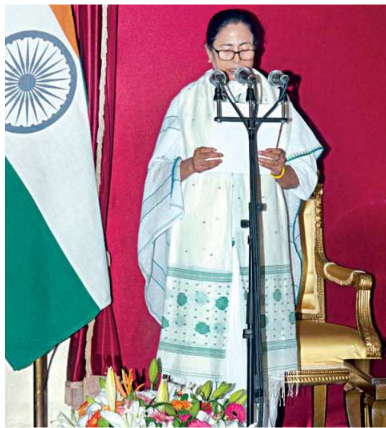
All India Trinamool Congress (AITC) party leader Mamata Banerjee takes formal oath as Chief Minister of West Bengal state at the Raj Bhavan in Kolkata yesterday.

"Everybody wanted to say to follow the rules and regulations to avoid unnecessary hassles," he said.