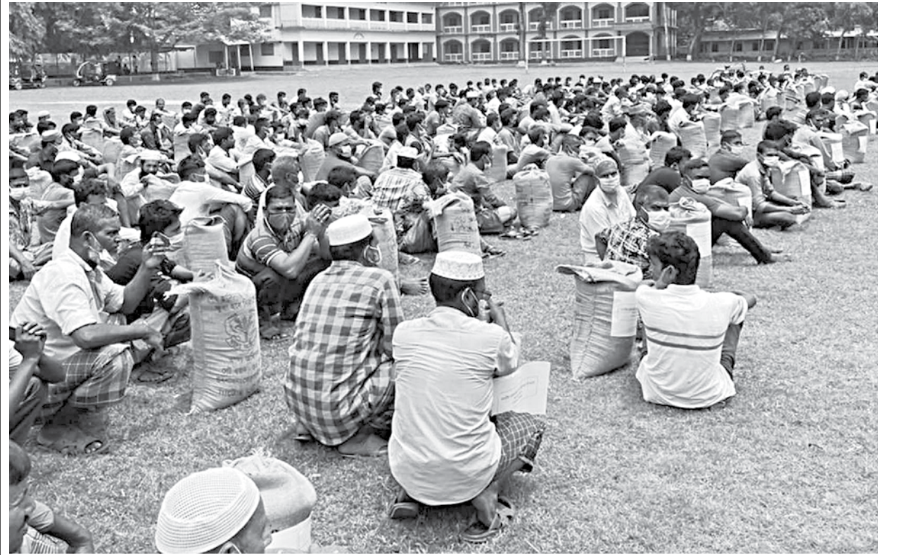
Four hundred and nineteen 419 bus staffers, who have been sitting idle due to the ongoing countrywide lockdown, received 15 kilograms of rice each from Tangail's Gopalpur upazila administration on Tuesday. Tangail district administration allocated 63 tonnes of rice for a total of 4223 bus staffers in all the 12 upazilas of the district.

The reason behind the death will be clear after the autopsy, the OC added.