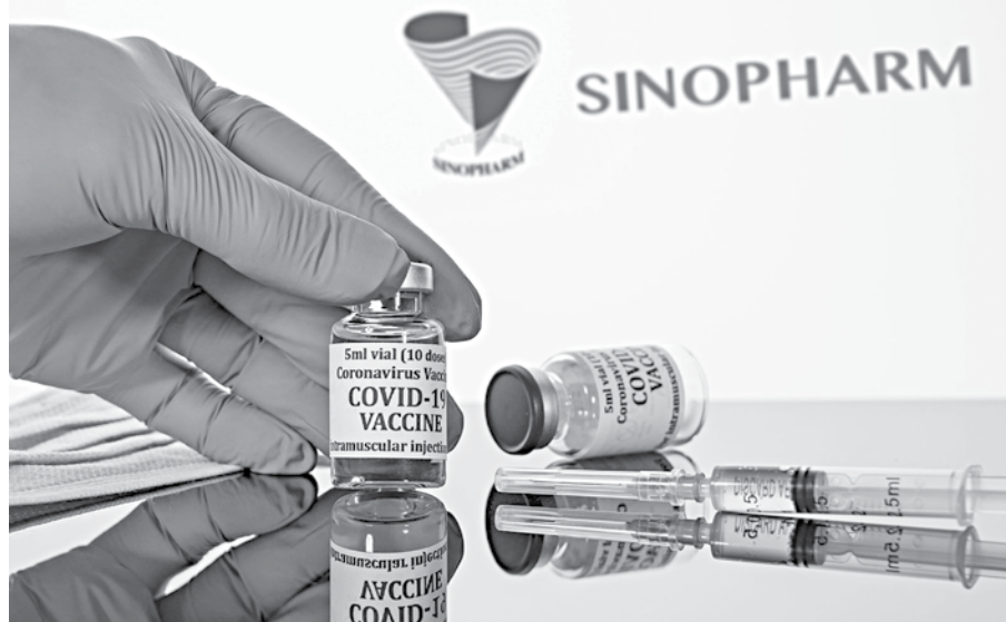
Bangladesh has approved both the Russian Sputnik V and China's Sinopharm vaccines for emergency use against Covid-19.