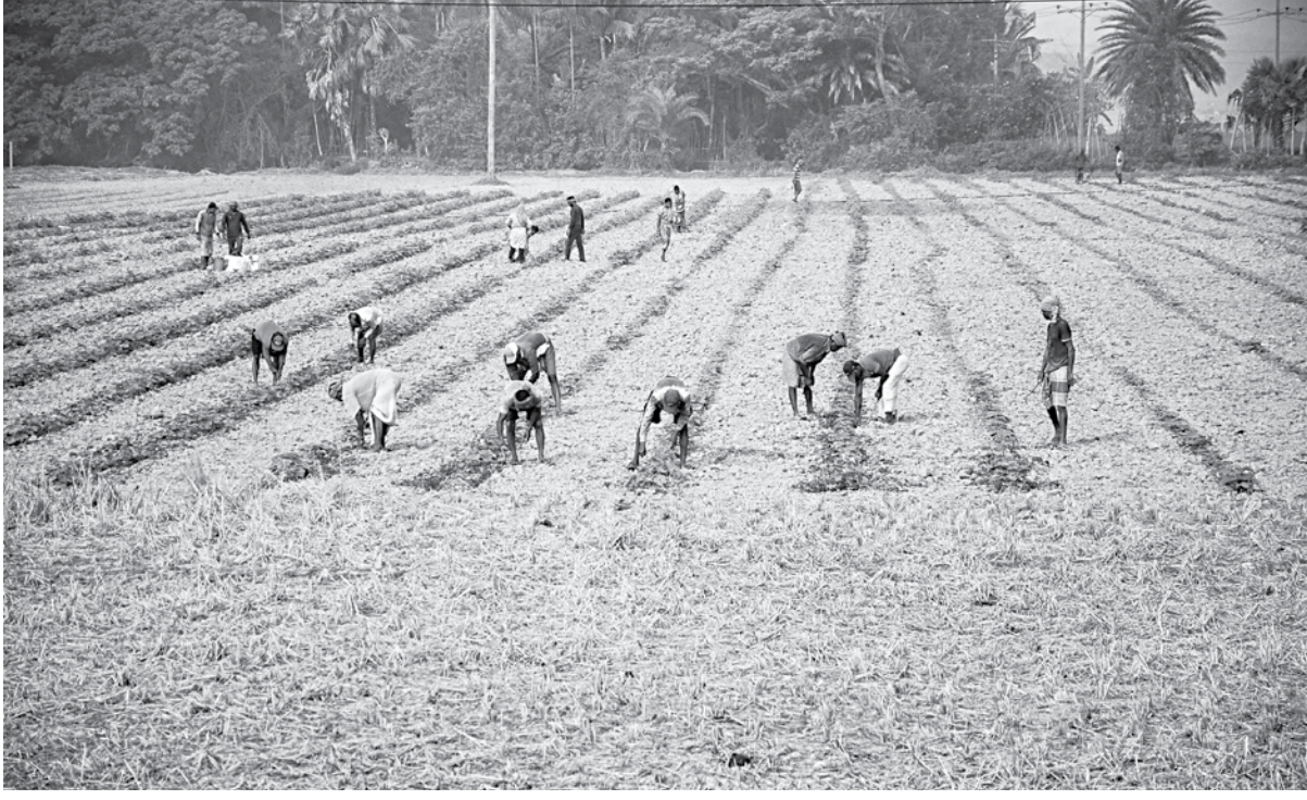
Workers tending saplings in a watermelon field in Katianagla village of Khulna's Batiaghata upazila. The scrumptious summer fruit is being cultivated on about 3,407 hectares of land in the district this year.