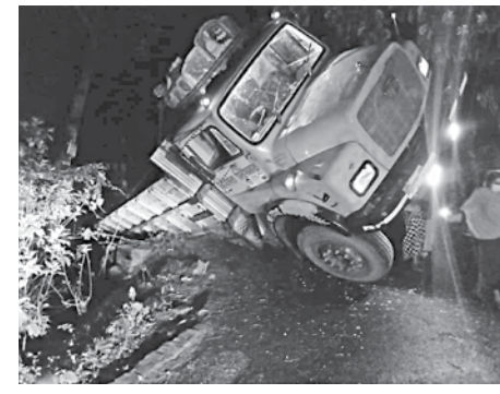
The worn-out bridge on a canal in Tangail's Nagarpur upazila collapses when a sand-laden truck was crossing it on Friday night.