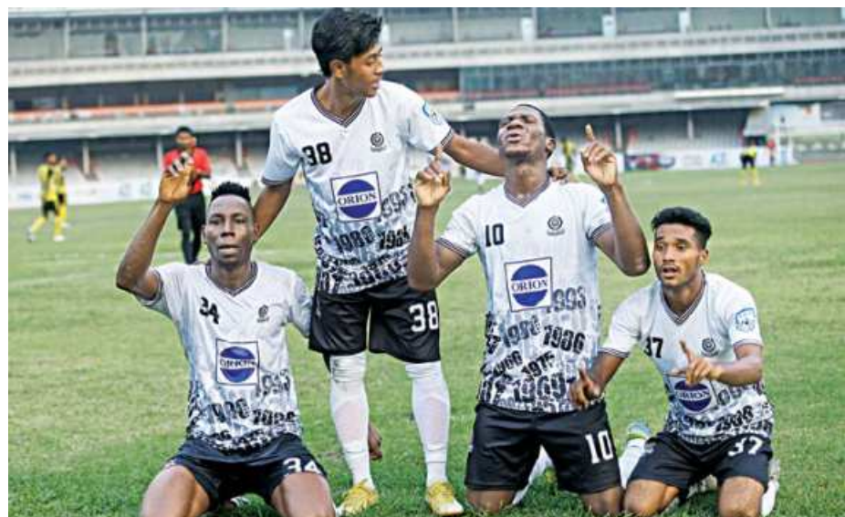
Mohammedan players celebrate one of their two goals in a 2-1 win over Saif SC at the Bangabandhu National Stadium yesterday.

The sixth triumph meant Ctg Abahani remain seventh with 22 points from 14 games while Arambagh suffered 13 defeats in 14 matches and have only one point.