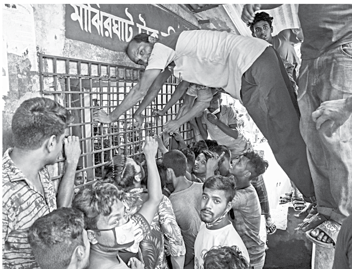
Transport workers surround a tiny booth at Chattogram city's Strand Road all day long, as they get to book their trucks for carrying consignments coming into Majhir Ghat area. With no spot to stand, some are balancing themselves on ledges, while one precariously dangles above his fellow workers. All of them are at risk of contacting Covid-19, as many can be seen without face-masks, and social distancing is non-existent. This photo was taken on Tuesday.

His books include "Muktijudhho or Rajniti", "Bangladesher Samaj o Rajniti", "Swadesh Chinta", and "A Sector Commander Remembers Bangladesh Liberation War".