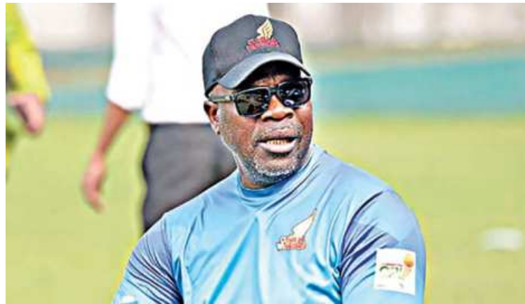
all the formats?

DS: Will he be able to perform well in all three formats? And can he play