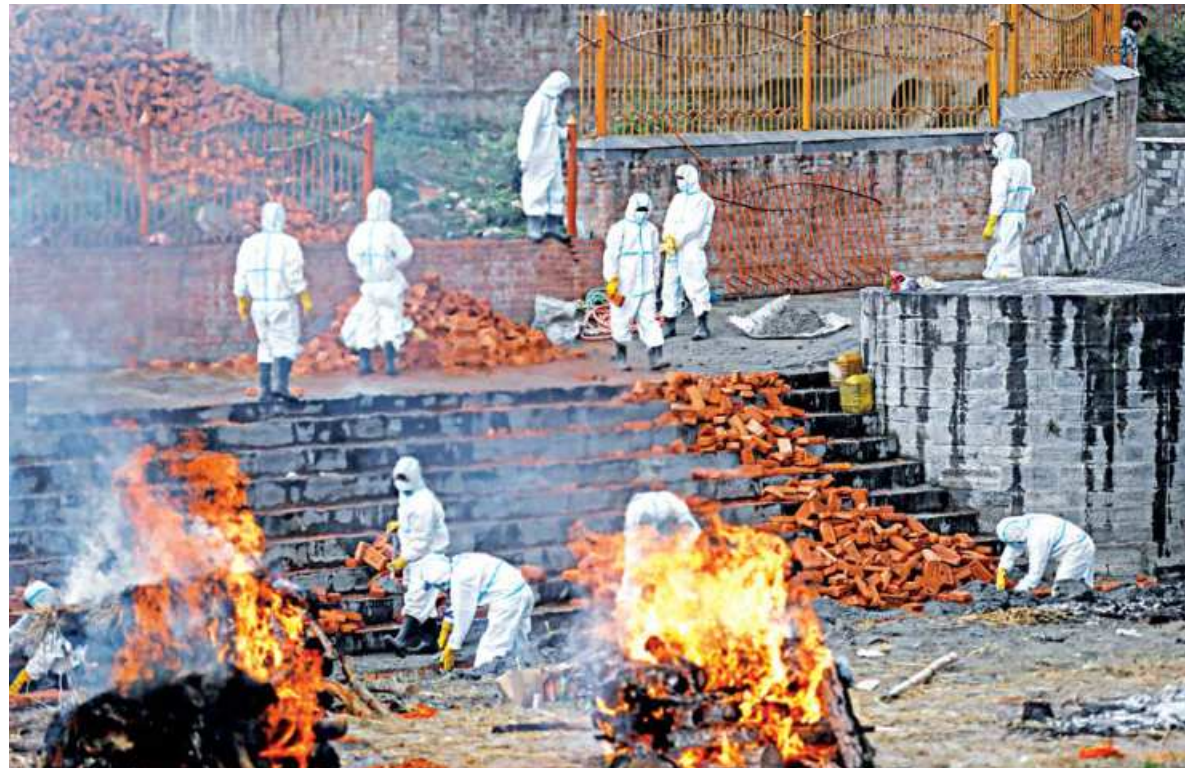
A number of workers wearing personal protective equipment at a crematorium in Kathmandu, Nepal, yesterday. The crematorium is undergoing an extension to cope with the surge of Covid-19 deaths, as India's outbreak spreads across South Asia.