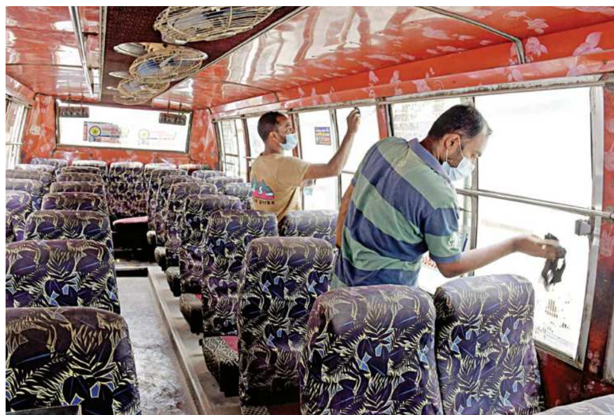
Workers were seen cleaning buses to get the vehicles ready for the roads. Much to commuters' relief, buses are set to ply the streets of Dhaka starting today. The photo was taken yesterday at Gulistan.

Both of them have been carrying out propaganda campaigns inspired by violent extremist ideology through social media and other online platforms, CTTC officials said.