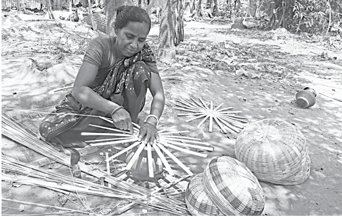
A member of Bed community, in Kayargachhi Abashan Prokolpo of Jhenidah Sadar upazila, making household accessories with bamboo.