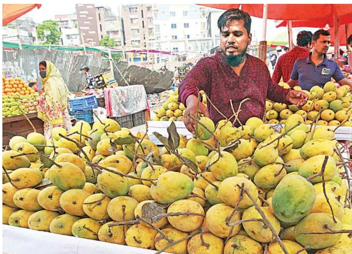
Early-season mangoes have begun to arrive at the markets in the capital, as summer rolls on. Sellers say Gopabhog and Gonindabhog are now available, at a price of Tk 100-120 per kg. The photo was taken earlier this week from Jatrabari.