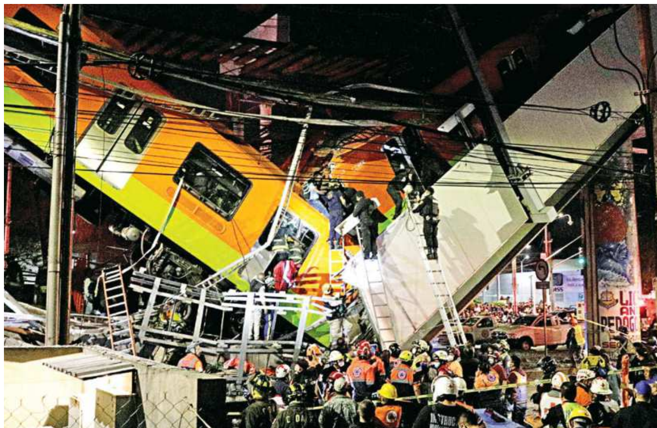
Rescuers work at a site where an overpass for a metro partially collapsed with train cars on it at Olivos station in Mexico City, Mexico on Monday night. At least 23 people were killed and 65 were hospitalized when the railway overpass and train collapsed onto a busy road.

The Mexico City subway has 12 lines and carries millions of passengers each day.