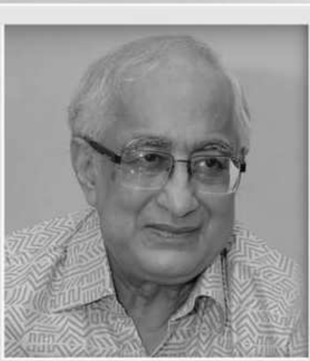
Jamilur Reza Chowdhury (1943-2020)