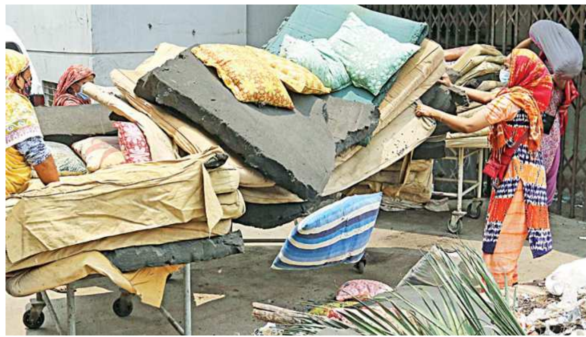
Staffers of Dhaka Medical College Hospital bring old beddings out of the Corona unit of the hospital yesterday for dumping. The beddings would be replaced with new ones.