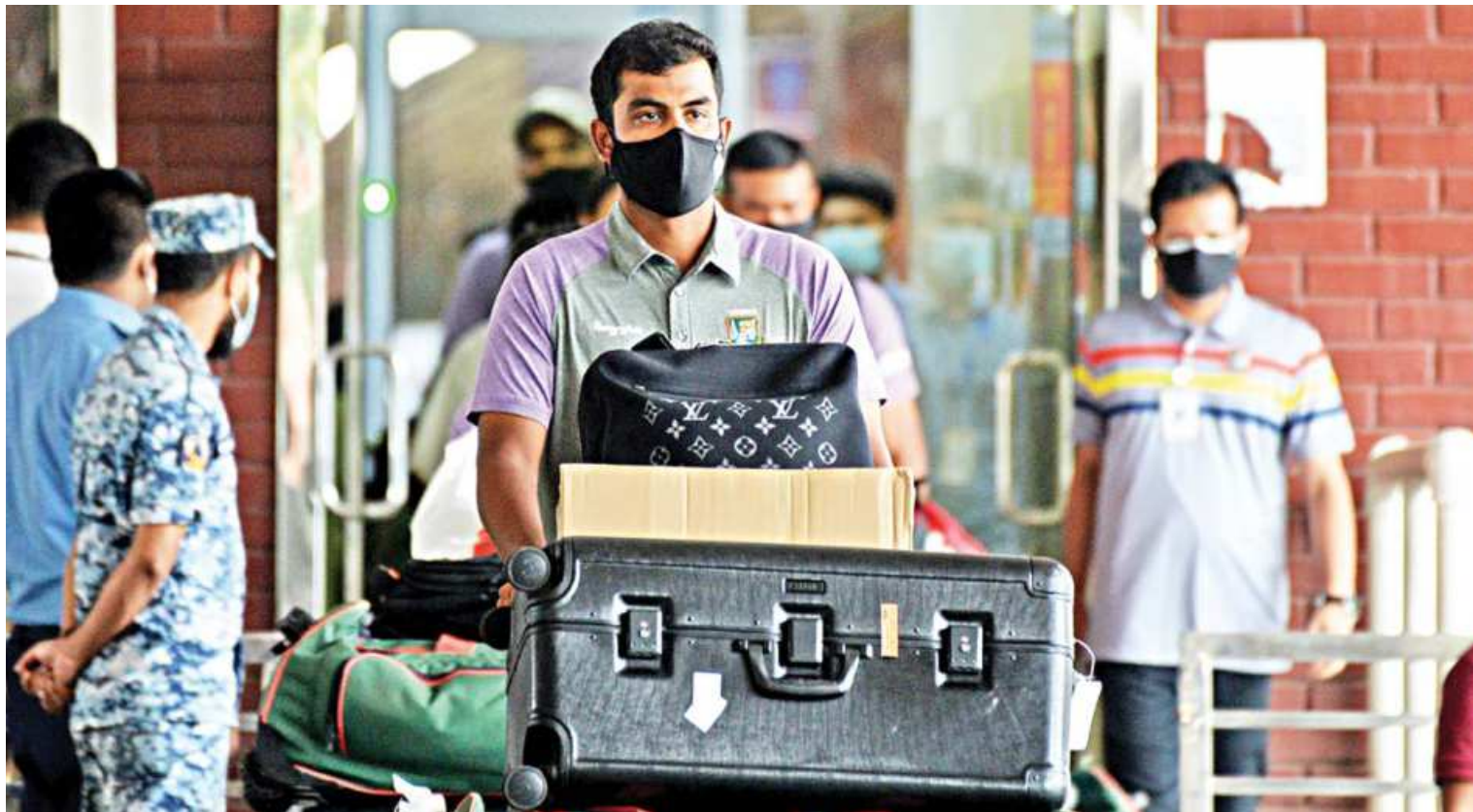
Bangladesh ODI captain Tamim Iqbal along with other team members returned home yesterday after the tour of Sri Lanka. The players will go through home quarantine before joining the other players of the preliminary squad for training ahead of three ODIs against Sri Lanka later this month.