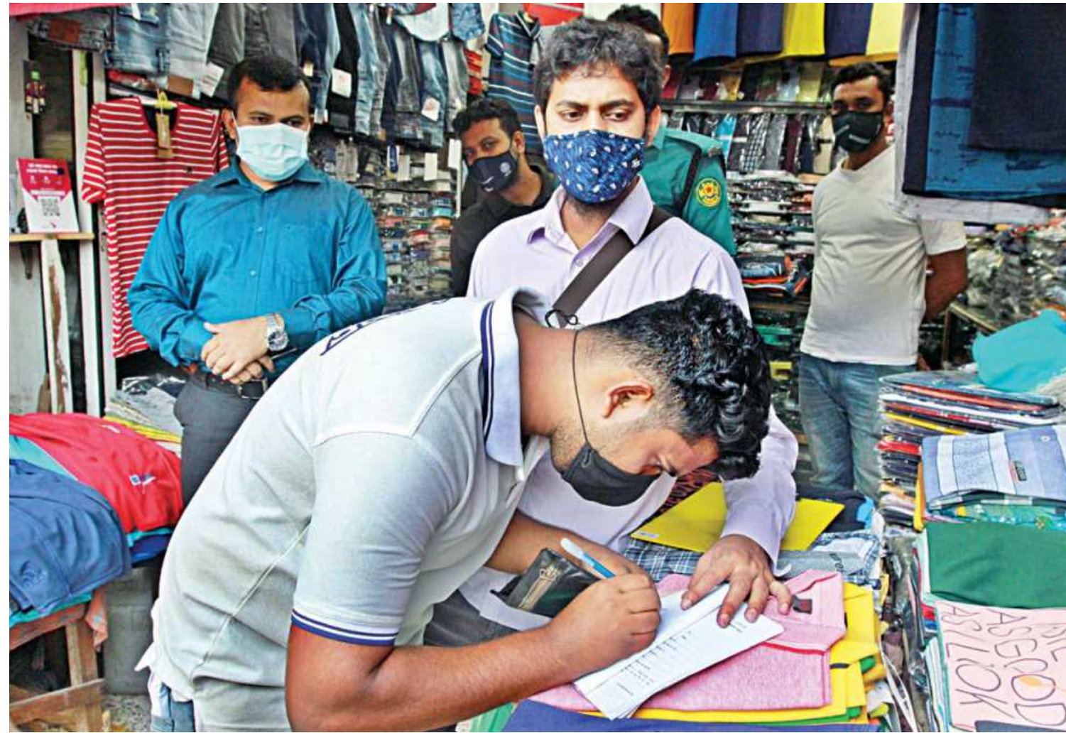
A mobile court of Dhaka Metropolitan Police conducting a raid at the Chandrima market in the capital yesterday. It fined shop owners and customers who did not wear face masks and follow health guidelines to prevent the spread of Covid.