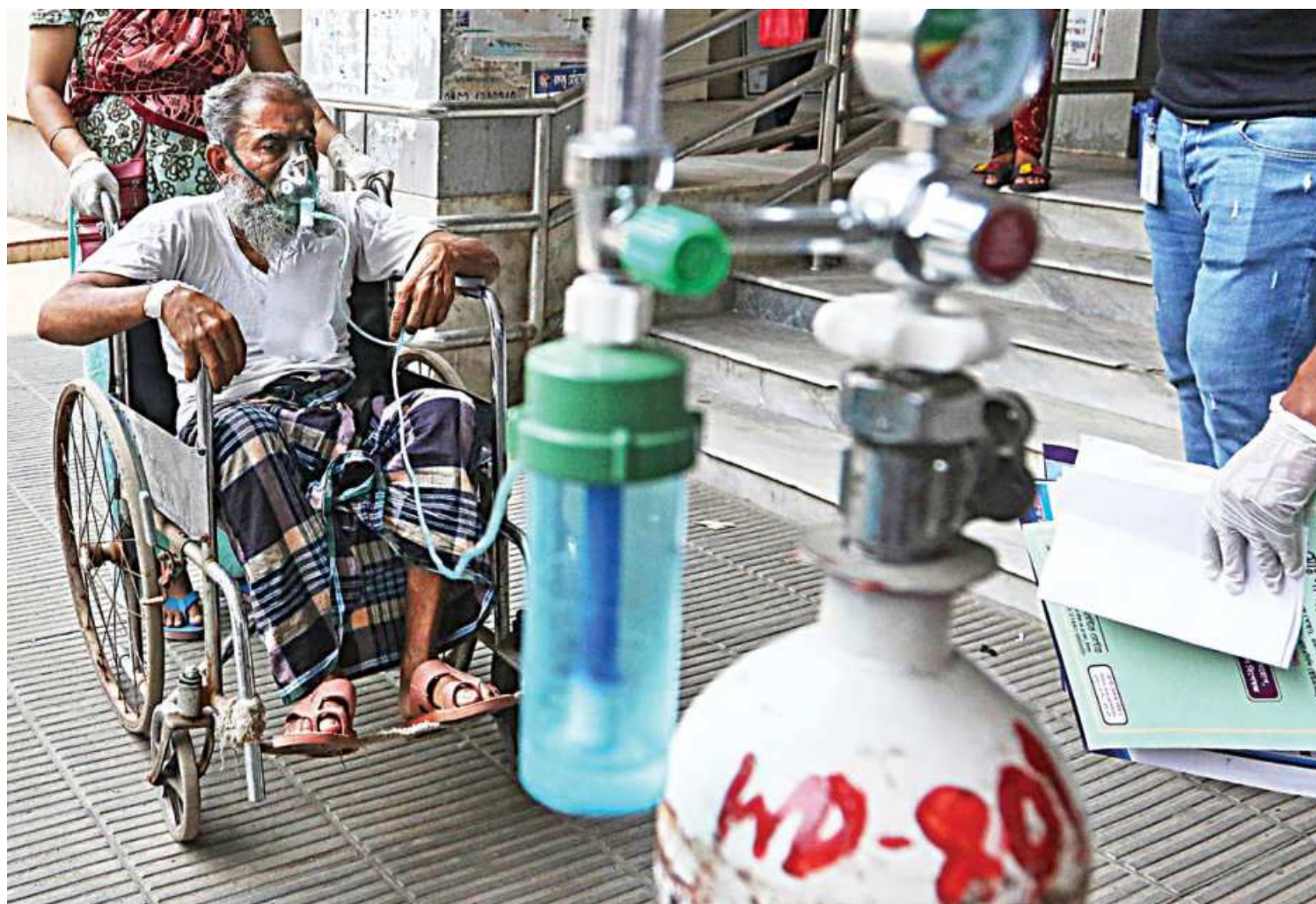
An elderly man from Chandpur comes to Shaheed Suhrawardy Medical College Hospital in the capital with breathing complications. For better oxygen supply, he was shifted to Dhaka Medical College Hospital. Later, he required ICU support for which he was being taken to DNCC Dedicated Covid Hospital in the capital's Mohakhali. Such are the ordeals many patients have to endure every day. The photo was taken yesterday.

Locals expressed anger SEE PAGE 10 COL 1