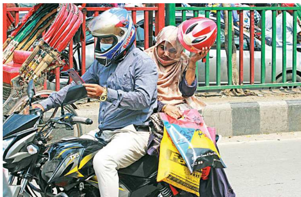
Instead of keeping his eyes on the road, this motorcyclist was spotted checking his phone in the middle of the road. If that wasn't careless enough, the pillion is holding a helmet with one hand instead of wearing it, as she sits precariously on the moving vehicle while holding bags with the other. The photo was taken from the capital's New Market area yesterday.