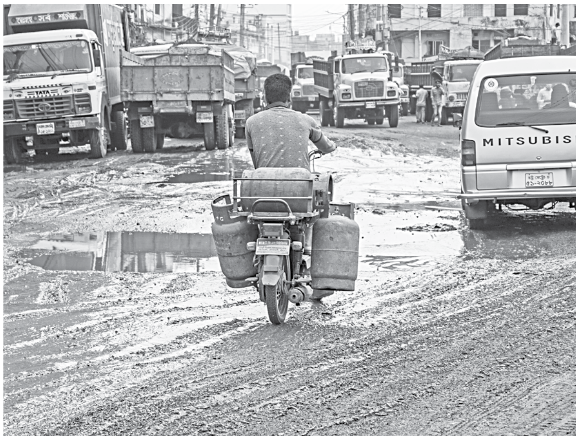
The sluggish repair work of Chattogram city's Strand Road has made the thoroughfare inconvenient for vehicles, as many drivers have a hard time manoeuvring through the puddles and mud. This photo was taken yesterday from Majhir Ghat area.