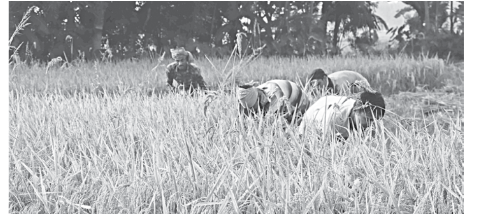
Farmers busy harvesting Boro paddy in a field at Jujkhola village of Pirojpur Sadar upazila. The photo was taken recently.

The government has set a target of buying 4,260 tonnes of paddy, at Tk 27 per kilogram, between April 28 and August 16 this year, as per a notice issued by the food ministry.