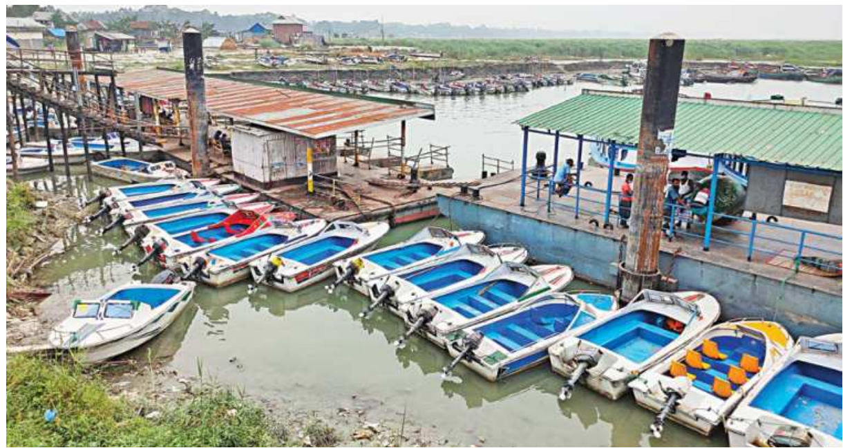
Unregistered motorboats are parked at Shimulia speedboat ghat in Munshinganj's Lauhajang upazila yesterday, a day after 26 people were killed in a speedboat accident near Bangla Bazar Ferry Ghat in Madaripur's Shibchar upazila. These vessels ferry passengers on Shimulia-Bangla Bazar route illegally.