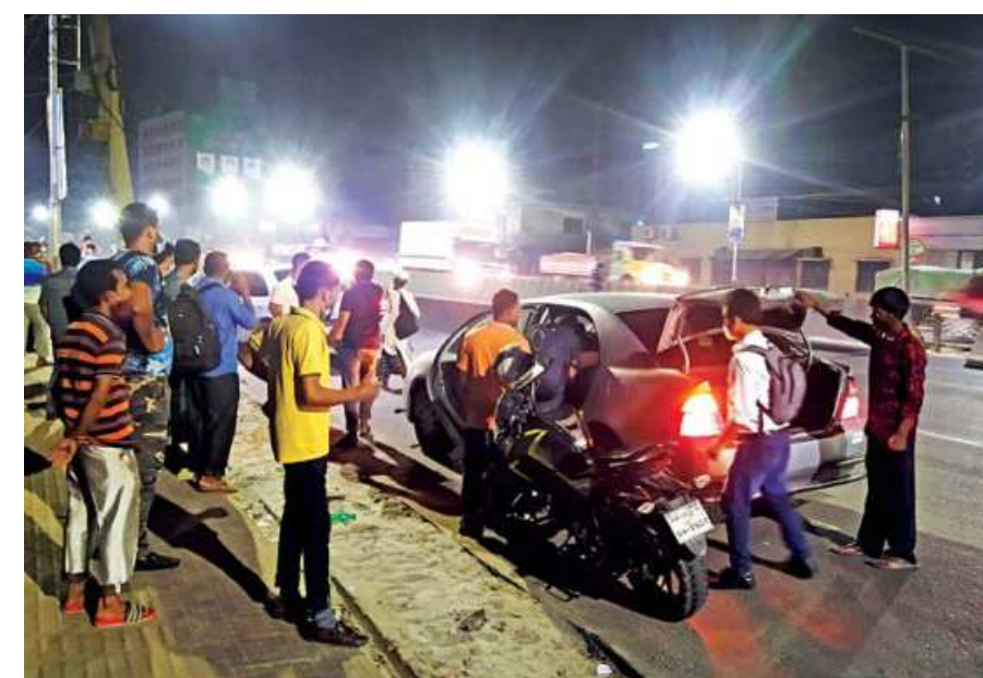
Inter-district passengers get in a private car, arranged by transport workers, at the capital's Gabtoli Bus Terminal area.