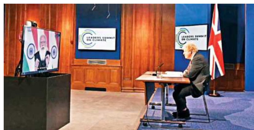
British Prime Minister Boris Johnson and his Indian counterpart Narendra Modi will hold virtual talks after the countries announced the start of free trade talks later this year.

"We want to get these negotiations completed as soon as possible," she told Sky News during a round