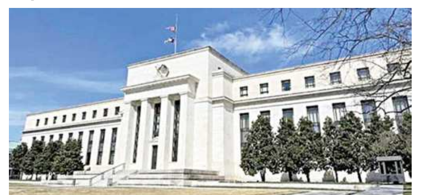
Top Federal Reserve officials have warned against growing overly concerned by price spikes as the US economy bounces back from the pandemic in 2021.

But as economic activity and consumer demand picks up after months of shutdowns, rising energy prices and the rebound from the pandemic downturn are pushing prices higher, fueling concerns about an inflationary spiral.