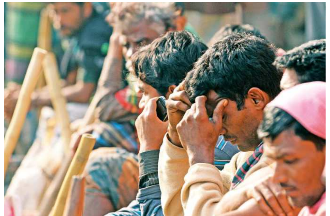
The low-income group hit hard by the Covid-19 pandemic needs more focus from the government now.