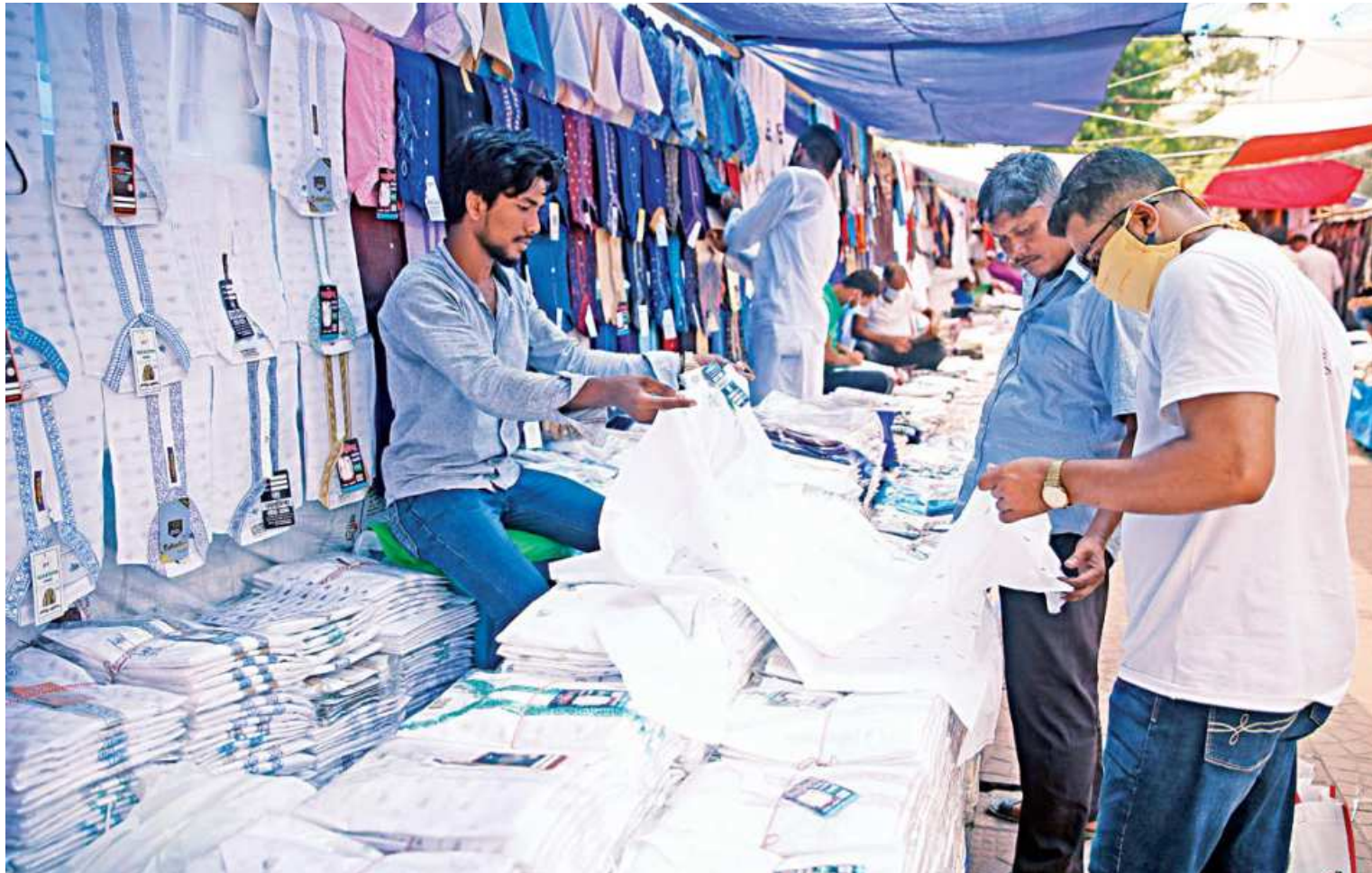
Panjabis at prices suiting people with budget limitations adorn this stretch of footpath in front of General Post Office on Bangabandhu Avenue in the capital. Customers are aplenty now for the fact that the upcoming Eid-ul-Fitr is one of the few times of the year Bangladeshis are more prone to purchase new attires for themselves and their loved ones. The photo was taken on Monday.