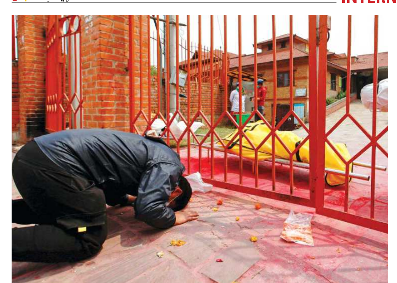
A family member (L) mourns a Covid-19 victim, as the number of deaths increases, amid the spread of the coronavirus disease in Kathmandu, Nepal yesterday.