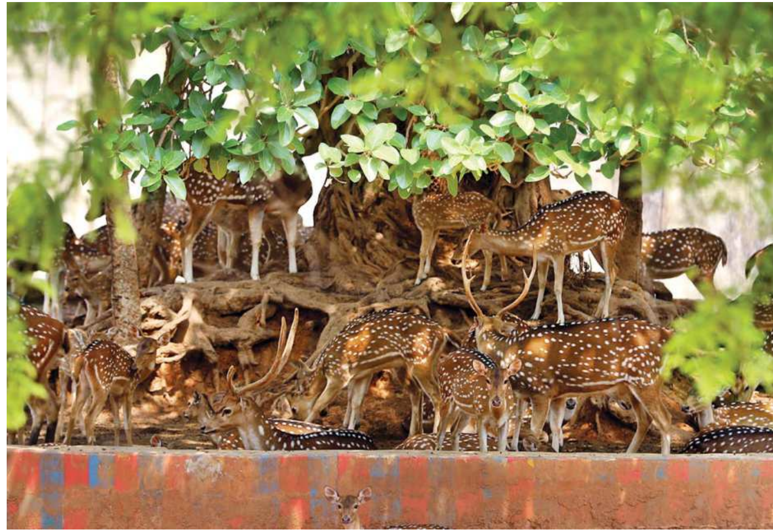
A herd of deer takes shelter under a tree to protect themselves from the scorching sun at the Bangladesh National Zoo in the capital yesterday. A spell of heat wave continues in the country.