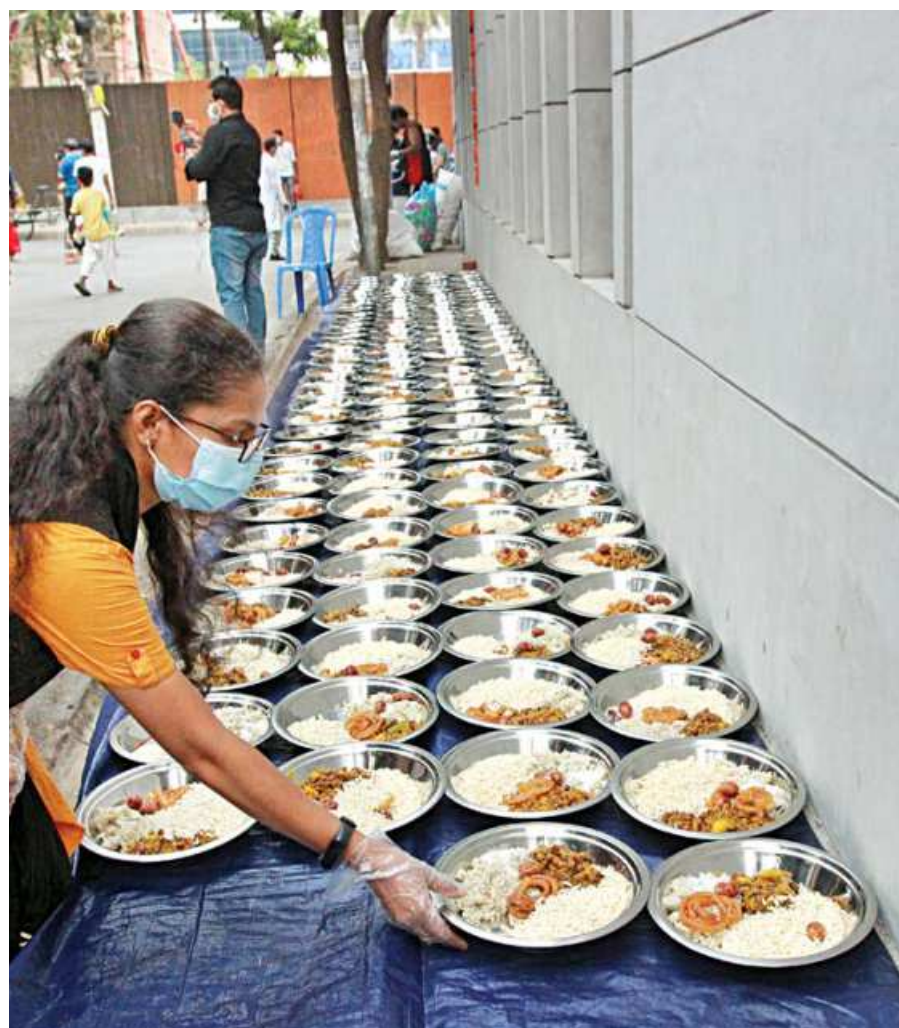
Plates full of iftar items being organised on a footpath yesterday in the capital's Lalmatia D-block for distributing among the poor. Voluntary organisation, "Mehomankhana", has been giving iftar to 1,000-1,200 people every day there.