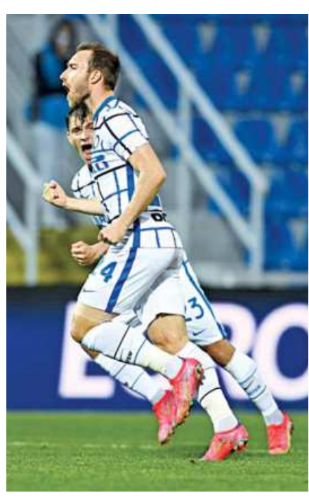
Inter Milan's Christian Eriksen celebrates after scoring their first goal during a 2-0 win over Crotone on

Atletico Madrid stayed in charge of La Liga's four-way title race by grinding out a 1-0 win at struggling Elche on Saturday but rode their luck to the extreme when the hosts missed a penalty in stoppage