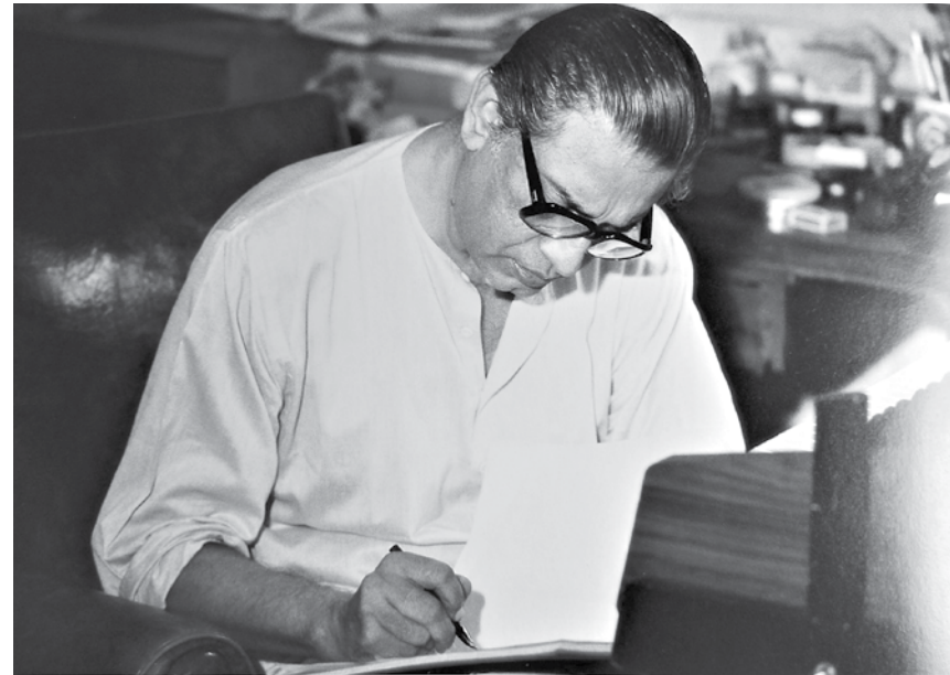
Satyajit Ray (May 2, 1921 – April 23, 1992).

box-office success in Kolkata. In 1956, Pather Panchali won a special jury award as the "Best Human Document" in the prestigious Cannes Film Festival. Upon its release in the US, the film ran for 36 weeks in the Fifth Avenue Playhouse in New York. Pather Panchali broke the record for the longest run in that movie theatre set by the famous German film The Cabinet of Dr Caligari . As we remember Satyajit Ray on his