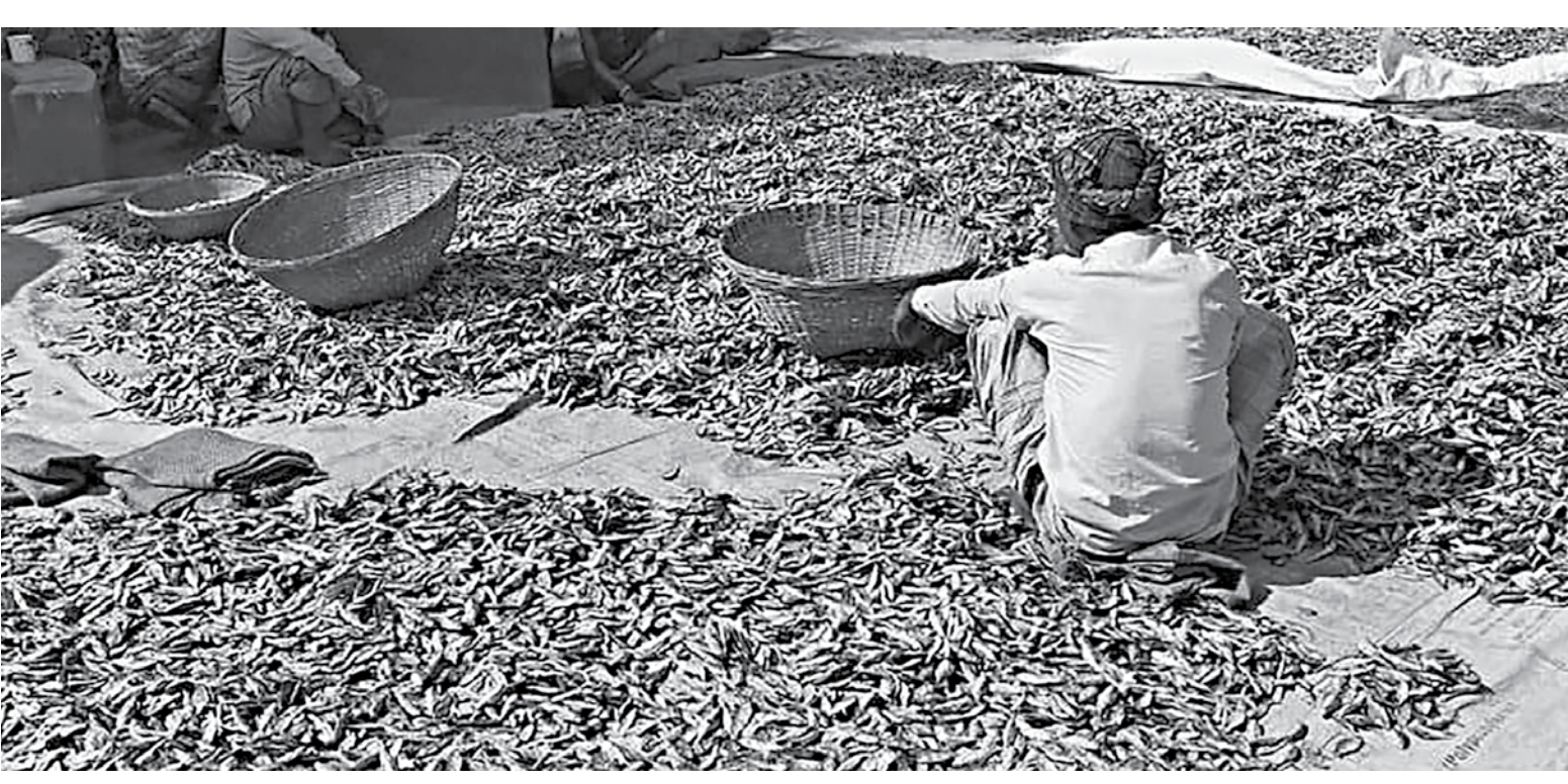
A farmer drying up fish in Barhatta upazila of Netrakona.

We are planning to support the fishermen with facilities of cold storage, dryer machines and sheds so that they can get benefited. Asked if they have any plan to give soft loans to the fishermen, the official said they are considering the matter seriously.