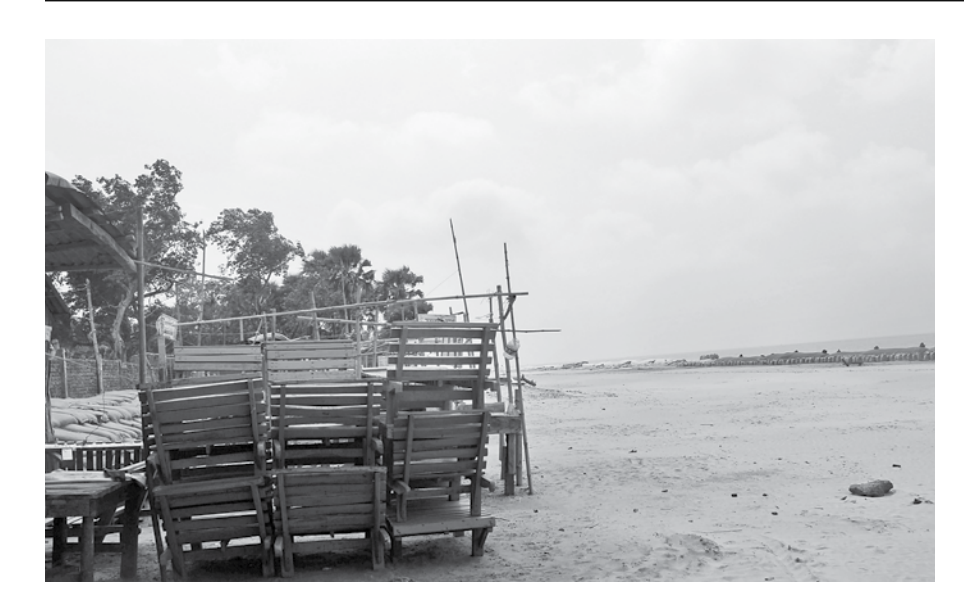
Empty beach chairs stacked up by the deserted sea beach of Kuakata. The photo was taken on Sunday, April 25.