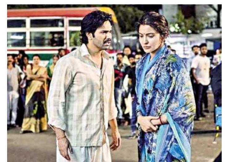
Sui Dhaaga: Made In India (2018)

The author is a freelance journalist, mislammonamee@gmail.com.