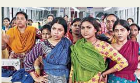
Made in Bangladesh

Starring Adarsh Gourav, Priyanka Chopra Jonas, and Rajkumar Rao, this Netflix movie traces the life of a driver who starts his own taxi service by outwitting his employers. In a captivating tale of escaping poverty and reaching the pinnacle of success, the film explores the various dynamics associated with a low-paying job. It is based on the Booker Prize winning novel of the same name, and addresses class differences.