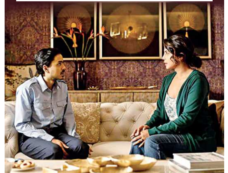
The White Tiger