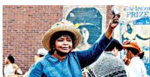
Self Made: Inspired by the Life of Madam C. J. Walker(2020)

Based on the book, "On Her Own Ground", this four-episode Netflix series features Octavia Spencer as Madam C.J. Walker. It navigates through the journey of an African American washerwoman who eventually builds her own beauty empire. The series tells the inspirational story of how a black woman became a self-made millionaire in turn-of-the-century America, overcoming different obstacles along the way.