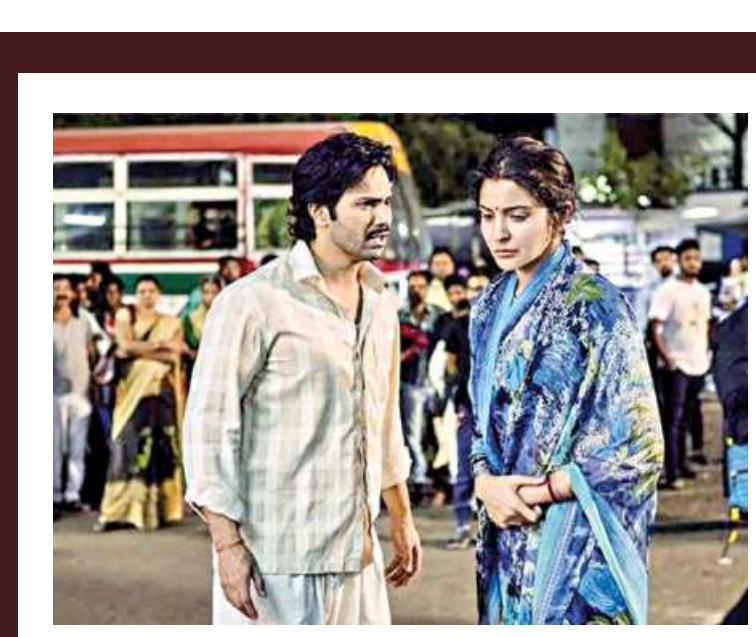
Sui Dhaaga: Made In India (2018)

The author is a freelance journalist, mislammonamee@gmail.com.