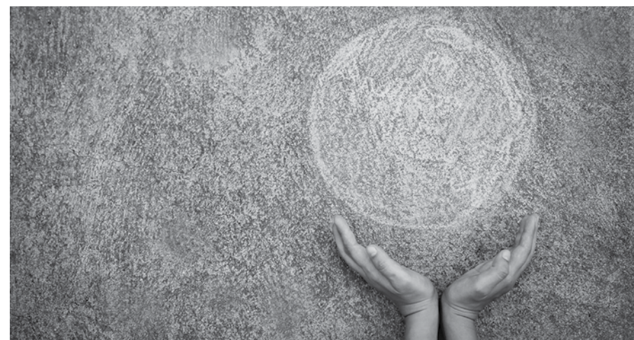
Only 18 percent of the current recovery investments can be considered “green”.

To correct our course, we must change the way we measure human development and social progress. Without the right signposts, we will be unable to achieve the transformation our economies