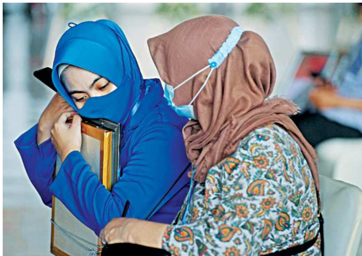
A relative of one of the sunken KRI Nanggala-402 submarine crew members hugs a photograph during a posthumous promotion ceremony at a navy airbase in Sidoarjo, East Java Province, Indonesia, yesterday. Indonesian President Joko Widodo said that authorities would build houses for the relatives of the crew of the submarine that went missing before being found in pieces on the bottom of the Bali Sea, killing all 53 inside.

The upsurge in clashes between the military and ethnic rebels has prompted some observers, including the UN, to warn that the country's crisis could spiral into a broader conflict.