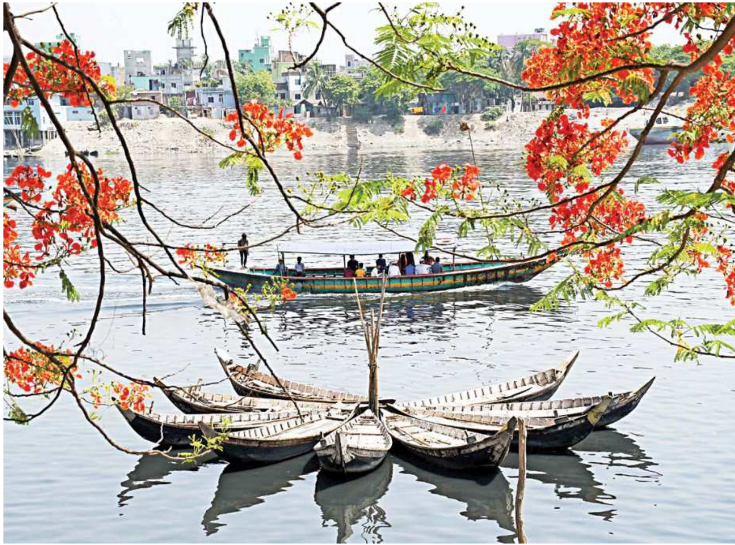
The ripples of Buriganga, the stationary boats at the centre forming the shape of a water-lily, and the vibrant Krishnachura flowers seeping into the view would bring anyone's mind to peace. Sadly, such moments are few and far between in these times, with only concrete visible outside people's homes, where they remain cooped up. This photo was taken from the capital's Kamrangirchar.