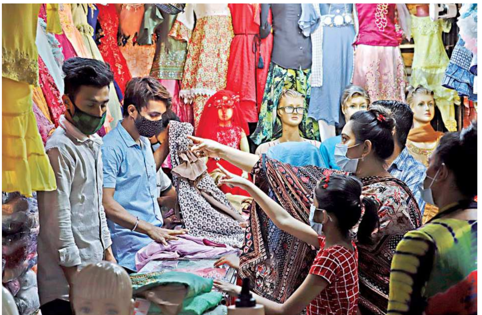
Shoppers and shopkeepers try their best to maintain health regulations while getting on with their day at Fortune Shopping Mall in Malibagh of the capital on Wednesday. The government allowed markets to remain open from 10:00am to 8:00pm every day, hoping to enable some sales for clothes traders ahead of Eid-ul-Fitr amidst the economic slump induced by the pandemic.