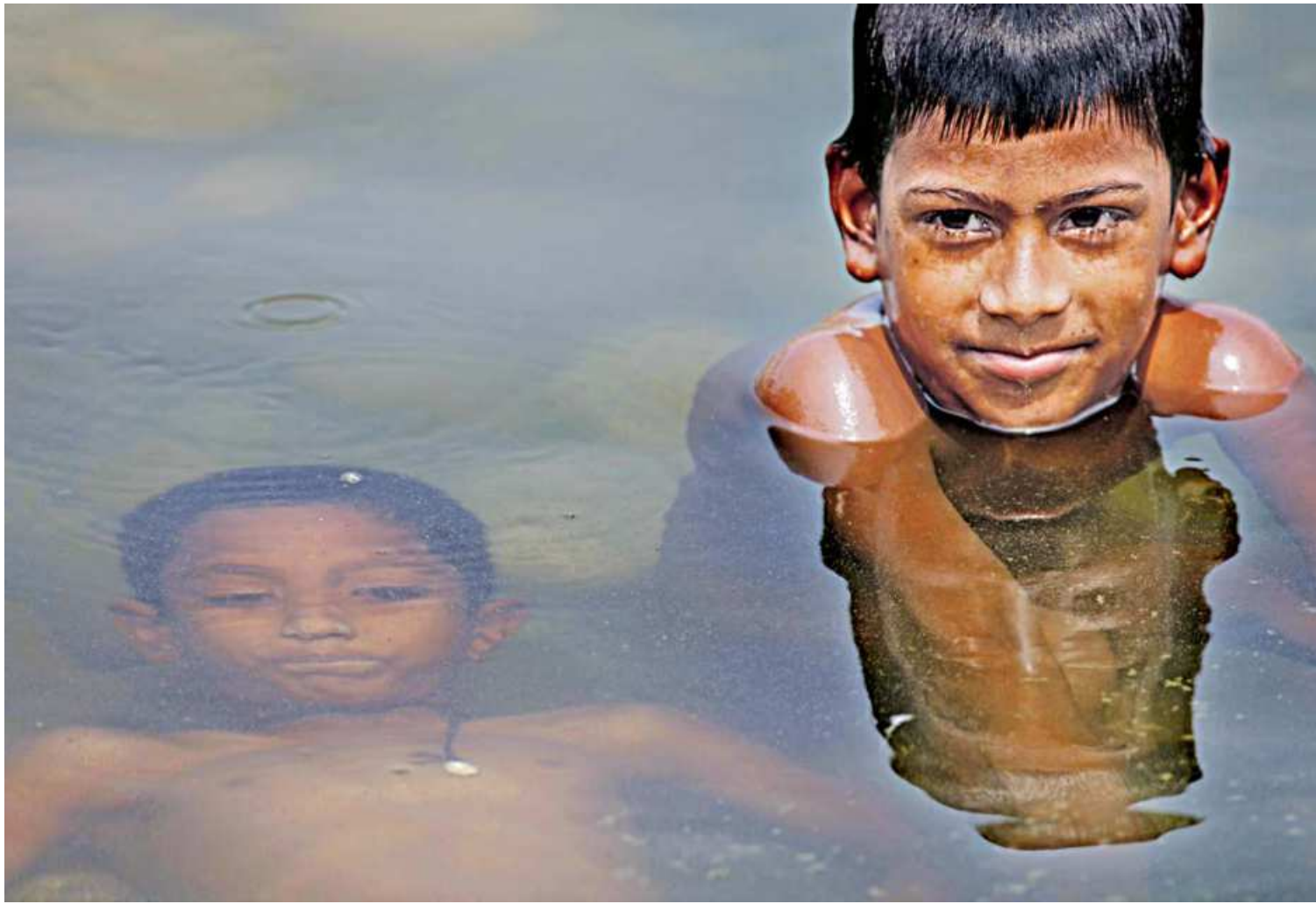
Due to the sweltering heat of the summer sun, children were seen taking a dip of relief in the pond situated inside the Suhrawardy Udyan. The photo was taken yesterday afternoon.