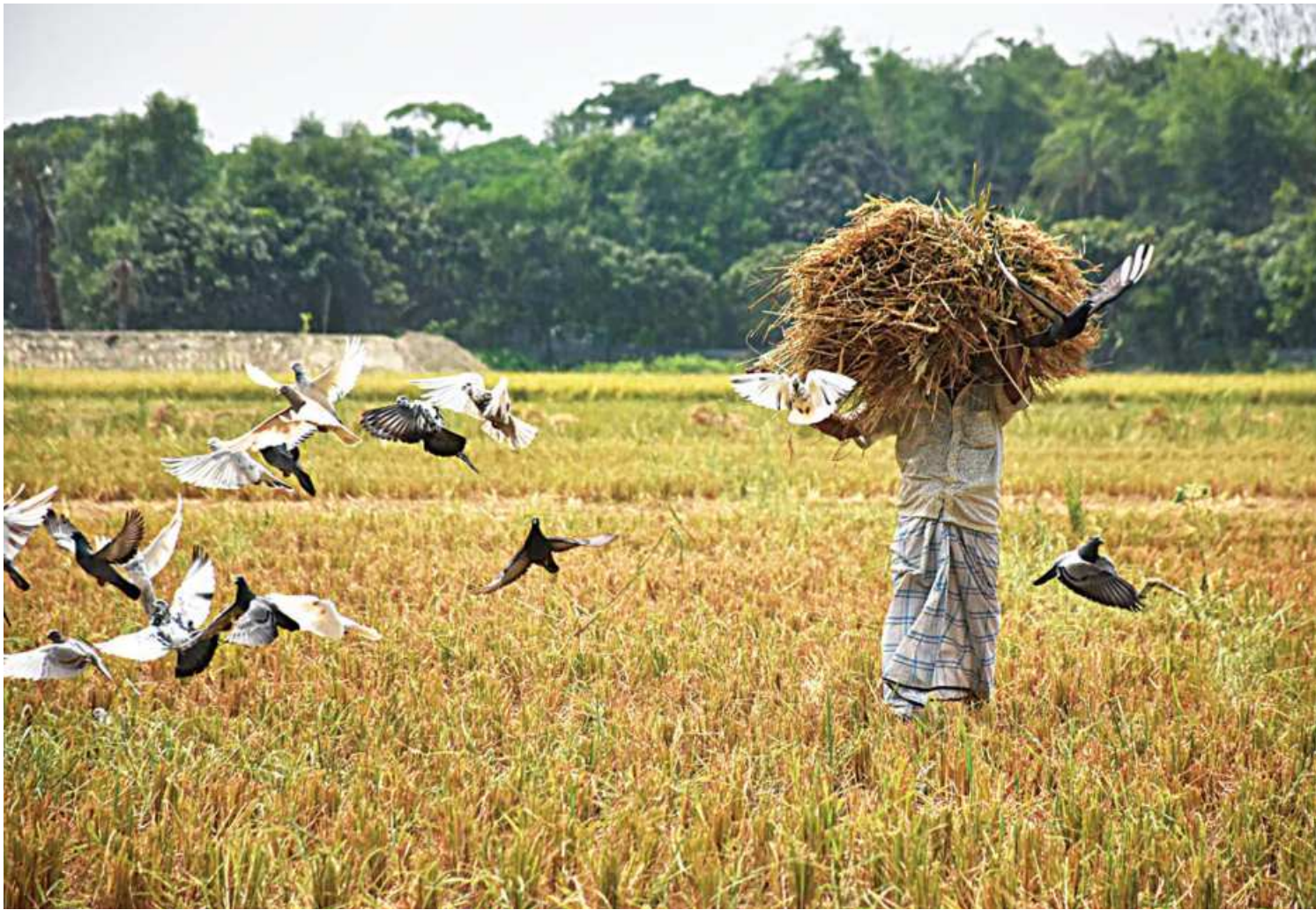
Pigeons flock over leftovers spread across farms after farmers gather and harvest ripe paddy from the fields in Kagashura village of Barishal sadar upazila. The photo was taken yesterday afternoon.