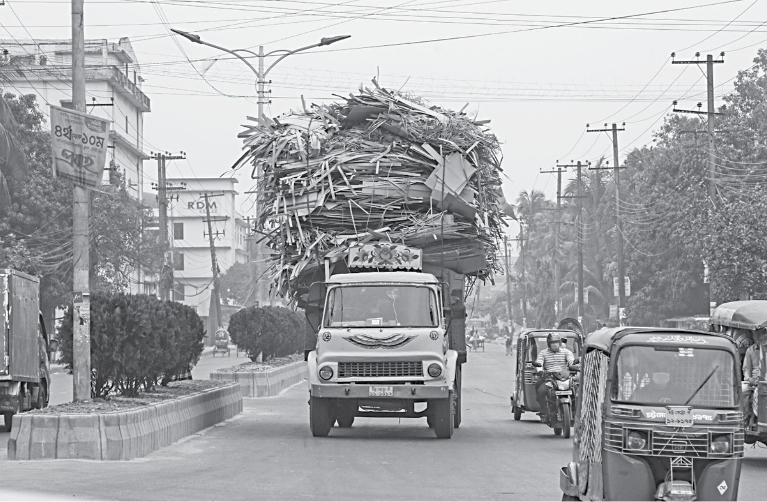
In complete violation of transport guidelines, this overloaded truck is plying through Chattogram city's Bayzid area. Though there are fewer vehicles on tge streets due to the lockdown, this is no excuse for running overloaded vehicles and putting everyone under risk. The photo was taken yesterday.