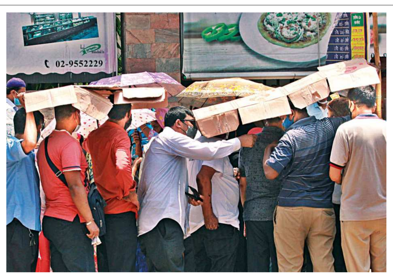
A group of people trying to protect themselves from the heat as they wait in line to buy essential commodities at a slightly lower price from a truck of Trading Corporation Bangladesh. The photo was taken in front of Hotel Purbani in the capital yesterday.

"For seven days, most of us haven't slept," said Dr K