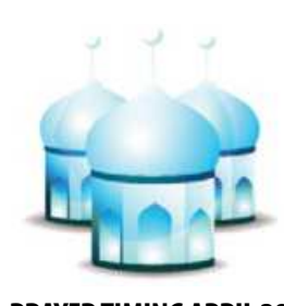
PRAYER TIMING APRIL 28

Fazr Zohr Asr Maghrib Esha AZAN 4-07 12-45 4-45 6-29 8-00 JAMAAT 4-17 1-15 5-00 6-39 8-30 SOURCE: ISLAMIC FOUNDATION