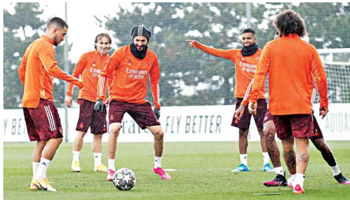
Real Madrid's in-form striker Karim Benzema (R) vies for the ball during a training session yesterday ahead of their Champions League semifinal first leg match against Chelsea tonight.